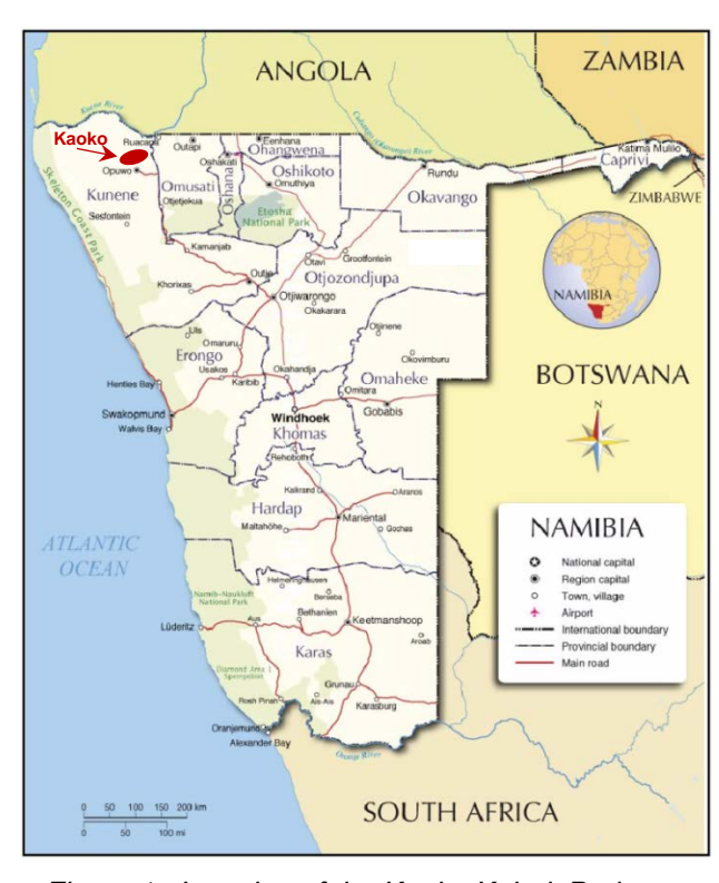
Figure 1: Location of the Kaoko Kobalt Project

Further details are outlined in the Company's presentation and 26<sup>th</sup> March ASX announcement which are available on the Company's website.