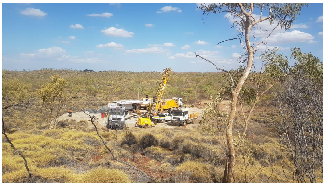
Figure 1: DDH1 diamond rig and support gear on FNDD001 drill site

DDH1 has been engaged for the drill program. Drilling of the first hole (FNDD001) has commenced, with a planned depth of 470m. All drillholes will be cased with PVC to allow completion of DHEM surveys to assist with the identification of any sulphide mineralisation around the drill hole. Refer to the Company's announcement McKenzie Springs Project – Drilling Update dated 17 th August 2020 for further detail on the drilling program.