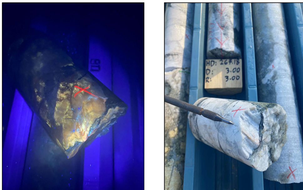
Photograph 1. Drill core from hole CBYD003 at ~267m showing pegmatite with ~20% visually estimated spodumene content under both UV and natural light. 5