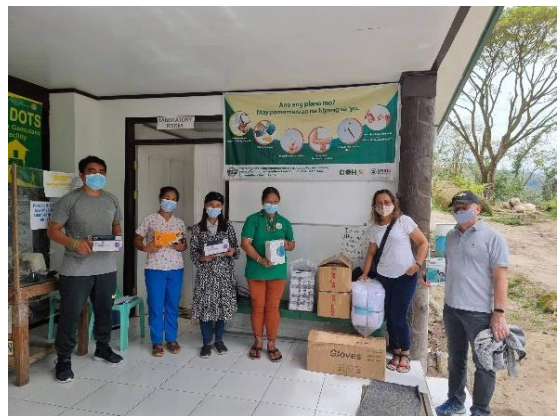
Image 2. Turn-over of Antigen Test Kits to the Local Health Office of Pasil, Kalinga Province

Engagements with the host communities and relevant local and national government agencies for recommending drilling were carried out in the past three months starting in December 2020. Specifically, further meetings with the Balatoc Tribal Council of Elders (COE) and Barangay Council officials were held to discuss local participation in employment and business opportunities brought about by Makilala’s exploration work program. These meetings have resulted in positive support from the host community whose local economy has been significantly affected by the pandemic. As of time of writing, Makilala has provided direct and indirect employment to 70 people of which 78% are rotational workers from the host community.