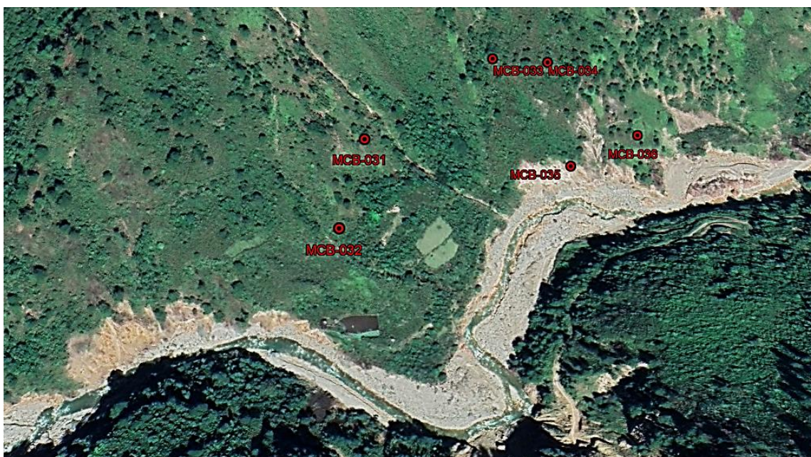
Figure 2: Topo Map of MCB Drill Hole Locations