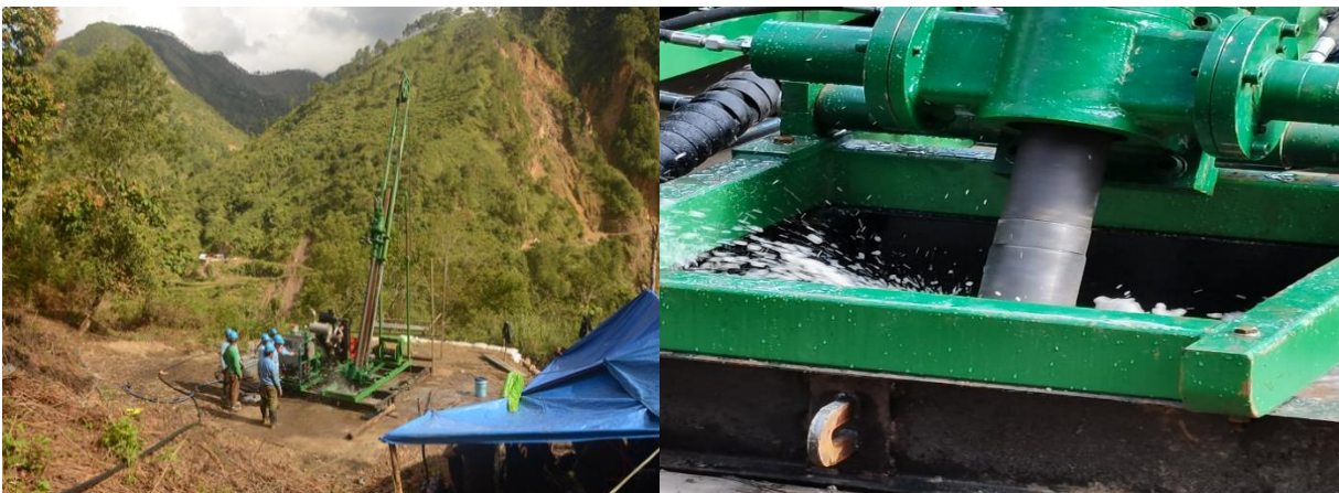
Image 1. Drill Rig at MCB 33 in operation