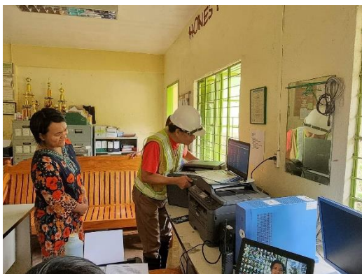
Image 3: Printer/photocopiers provided to the host community high school.

As part of Makilala’s Community Development Program, and in order to assist the Local Government of Pasil in its drive to prevent the spread of COVID-19 in the locality, the Company has donated antigen test kits for the local health office, as well as personal protective equipment for its frontline workers. This helps allay fear among the host community members over the spread of COVID-19 from Company personnel/staff coming in and out of the community. Company personnel and staff undergo routine tests prior to entry to the project site as part of local health protocols.