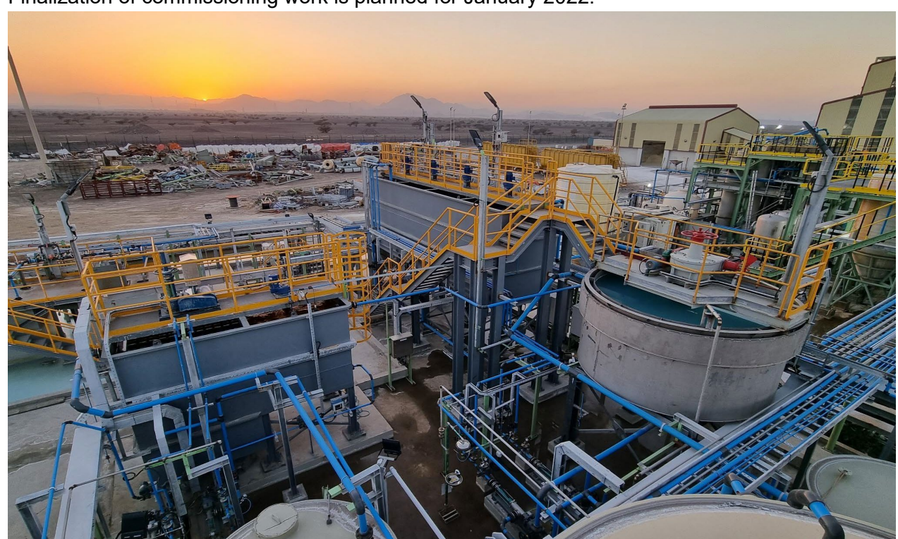
Oman CIF® plant

In Oman, CNQ was asked to provide an expansion of its previous Oman project where our CIF® technology treats industrial brine from an antimony smelting plant for reuse. Installation of this expansion project is in progress and C3 commissioning status was achieved by December 2021. Finalization of commissioning work is planned for January 2022.