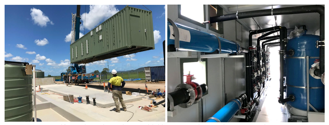
Koumala resin exchange drinking water plant under construction