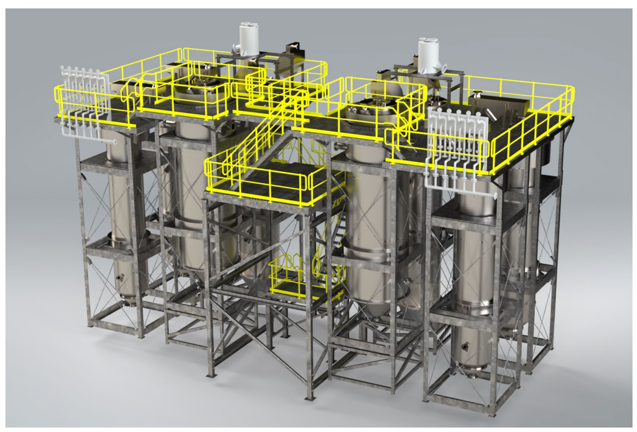
3D render NESR continuous ionic filtration plant that will be part of the HIROX® installation

The end-user will be a multinational oil company and the solution provided is expected to dramatically reduce not only the required water withdrawal, but also the energy and chemicals used for producing a ton of treated water.