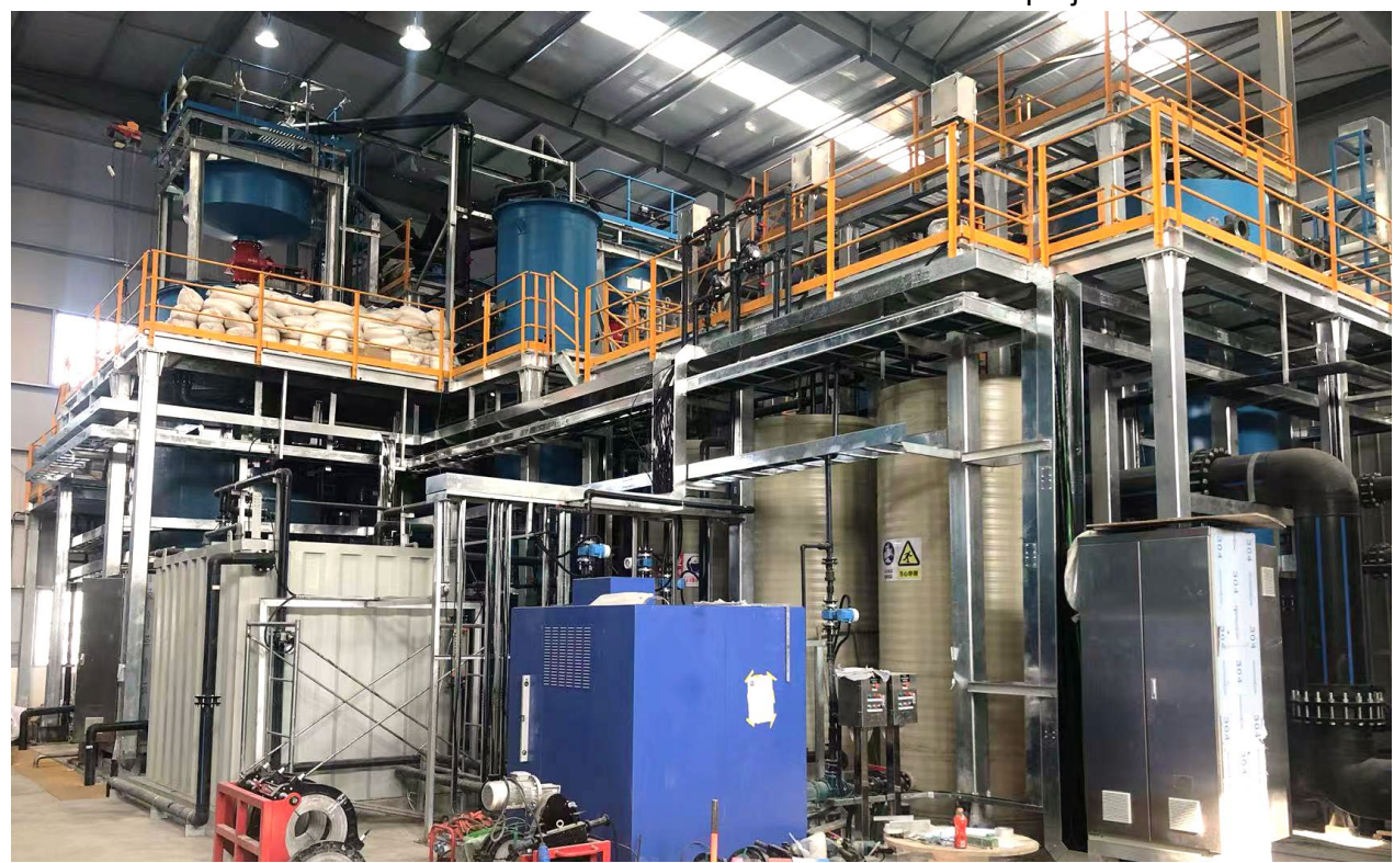
BIONEX™ plant at Ordos

The BIONEX™ plant will be the first of its kind in China and will act as a demonstration site for other prospective customers. The market for BIONEX™ includes nitrate removal from effluents from mines, industries, and municipal water treatment facilities located in ecologically sensitive areas such as the Yellow River basin in Northern China where this first project is located.