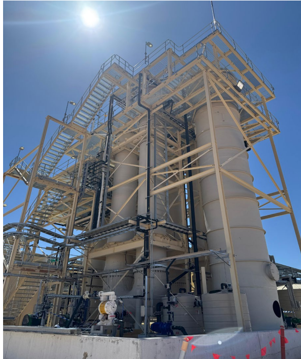
Clean TeQ's U-Column Enhanced Desorption Process at Heathgate Resources