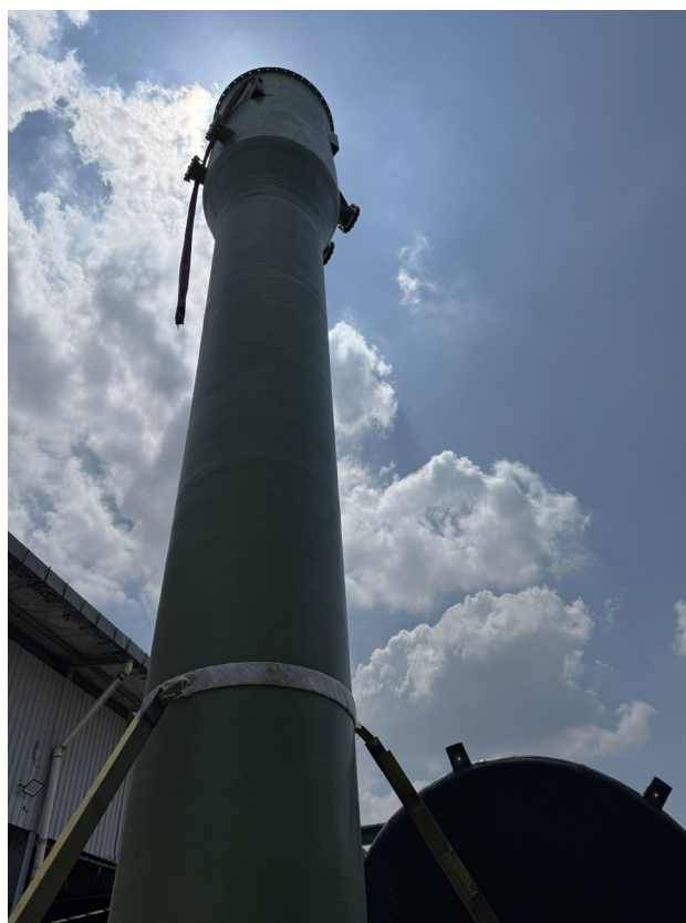
Procurement and delivery progressing on schedule. Image: MBIX desorption column

During the quarter, procurement and delivery activities continues to progress in line with the accelerated schedule, with all purchase orders now placed. The factory acceptance phase for all equipment is underway, with deliveries scheduled to occur during the current quarter.