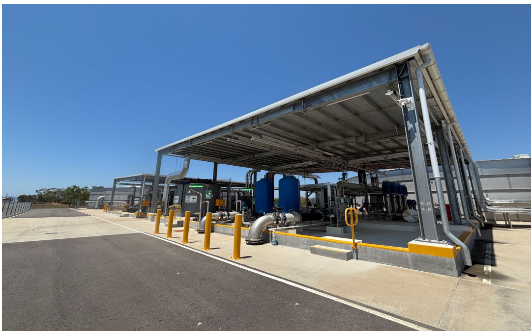
Townsville Water Recycling Facility has achieved practical completion

The project achieved practical completion following successful commissioning and process proving and has now been formally handed over to Townsville City Council.