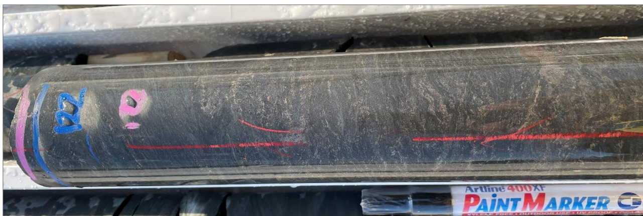
Figure 2. Core sample at 121.7m in YAD0015.