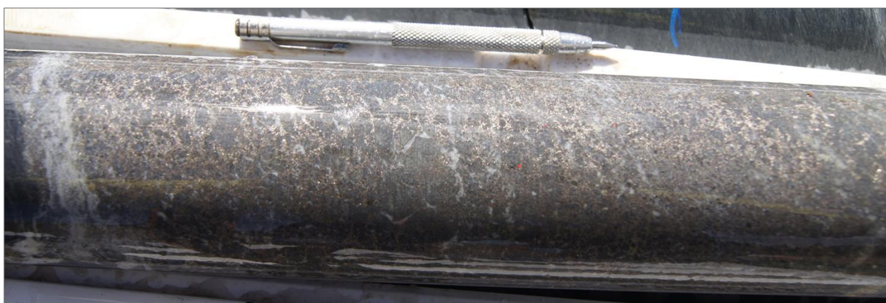
Figure 3. Core sample at 108.0m in YAD0014.

The final hole in the current campaign at XC-29, YAD0016, intersected a narrow zone of semi-massive sulphide dominated by pyrrhotite, within a broad 17m zone of significant stringer sulphide.