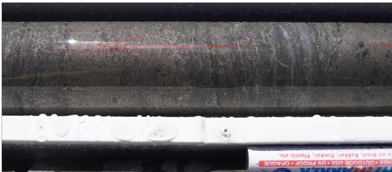
Figure 1. Interval at 100.05m in YAD0015.

The first hole, YAD0014, intersected a 10m zone of stringer to matrix textured sulphide, pyrrhotite dominant with rare chalcopyrite.