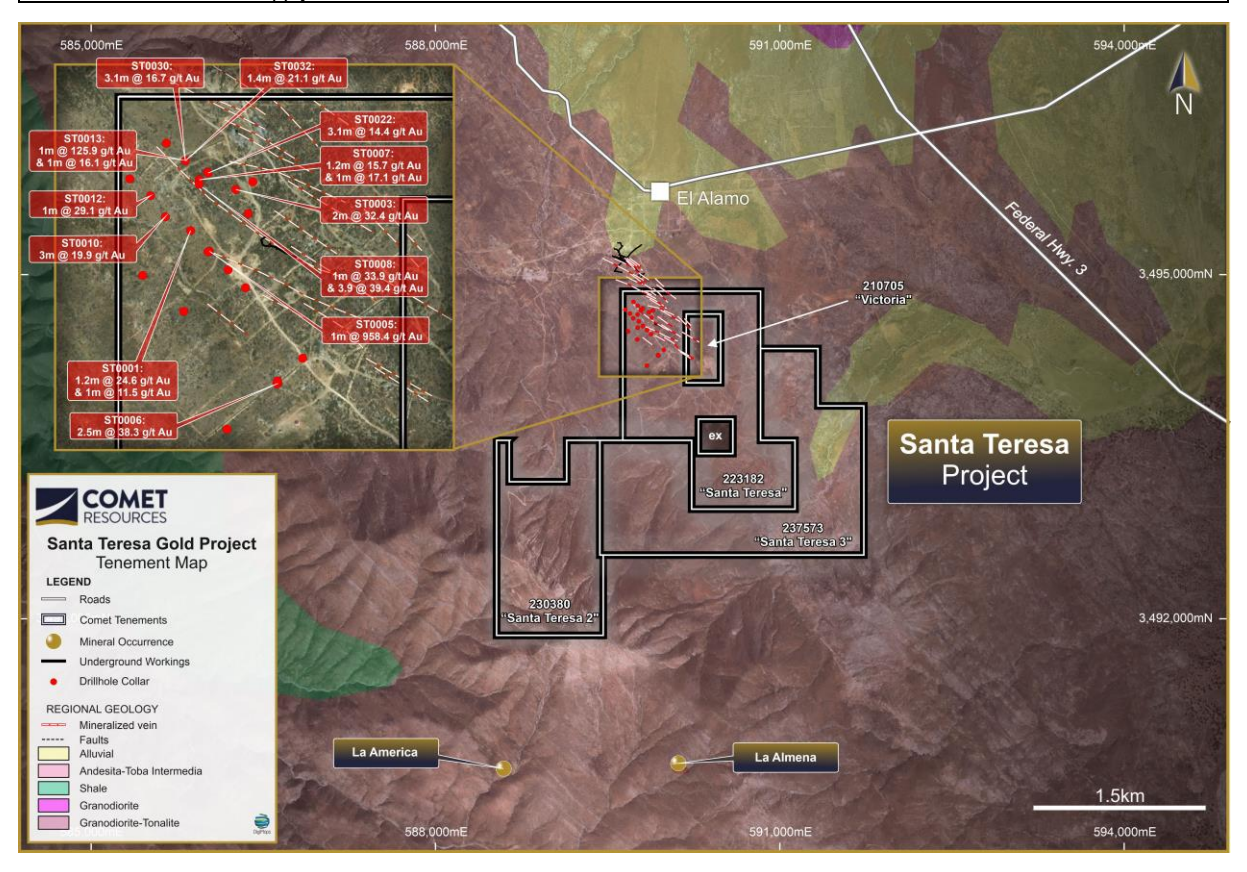
Figure 1: Santa Teresa Gold Project location and selected drill results

Existing Inferred Resource was reported under NI43-101 and has not been reported in accordance with the JORC Code. A competent person has not done sufficient work to classify the Inferred Resource as a mineral resource under the JORC Code. It is uncertain that following evaluation and/or further exploration work that the Inferred Resource will be able to be reported as a mineral resource in accordance with the JORC Code. Refer to the Company's announcement of 9 June 2020 for further details. The Company is not in possession of any new information or data relating to the Inferred Resource that materially impacts on the reliability of the Inferred Resource. The supporting information provided in the Company's announcement of 9 June 2020 continues to apply.