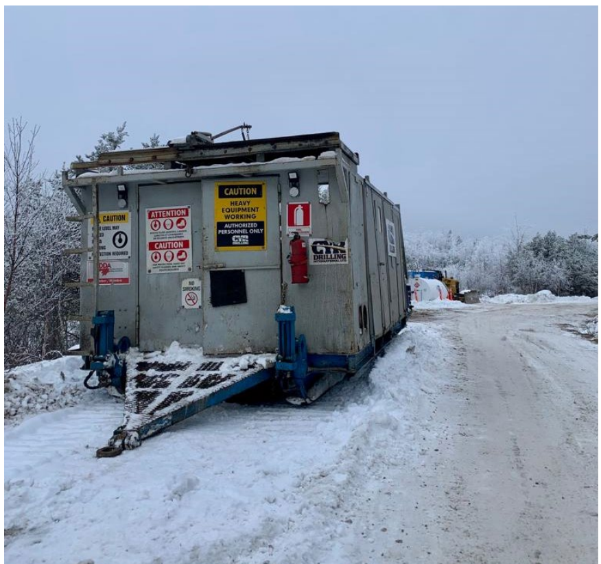
Figure 2 – Contractor Drill Rig 1 operating at Mavis Lake (top) Contractor Drill Rig 2 – deployed to Mavis Lake (bottom)