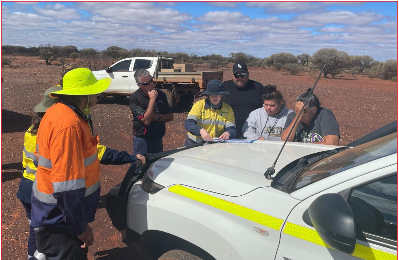
Figure 1: Cavalier and WTAC Representatives Carrying Out Planning Prior to On-Site Surveys

Following completion of the site preparation works, and subject to final approvals, Cavalier intends to progress to the next stage of development at Crawford, including pre-production and heap leach development activities targeted for Q3.