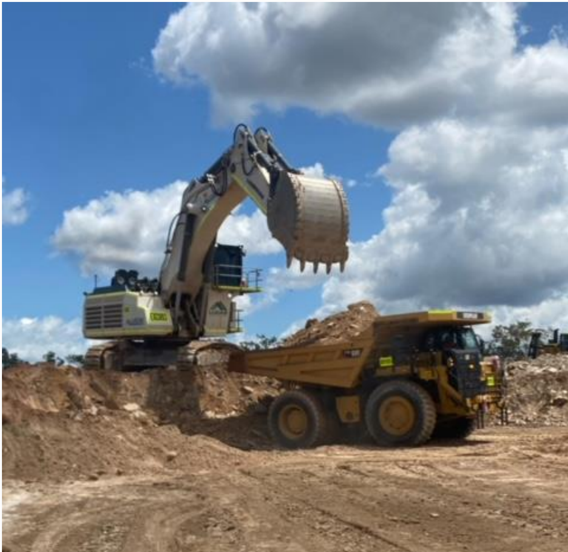
Figure 4. CAT777 truck being loaded at the Finniss Lithium Project

“As the end of the wet season approaches, we look forward to seeing site activities significantly ramp up, with our path to first production before the end of 2022 firmly on-track.”