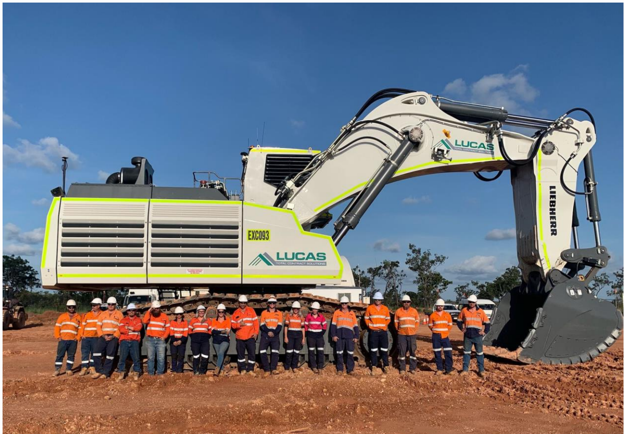
Figure 3. Liebherr R 9200 excavator arrives on site at the Finnis Project