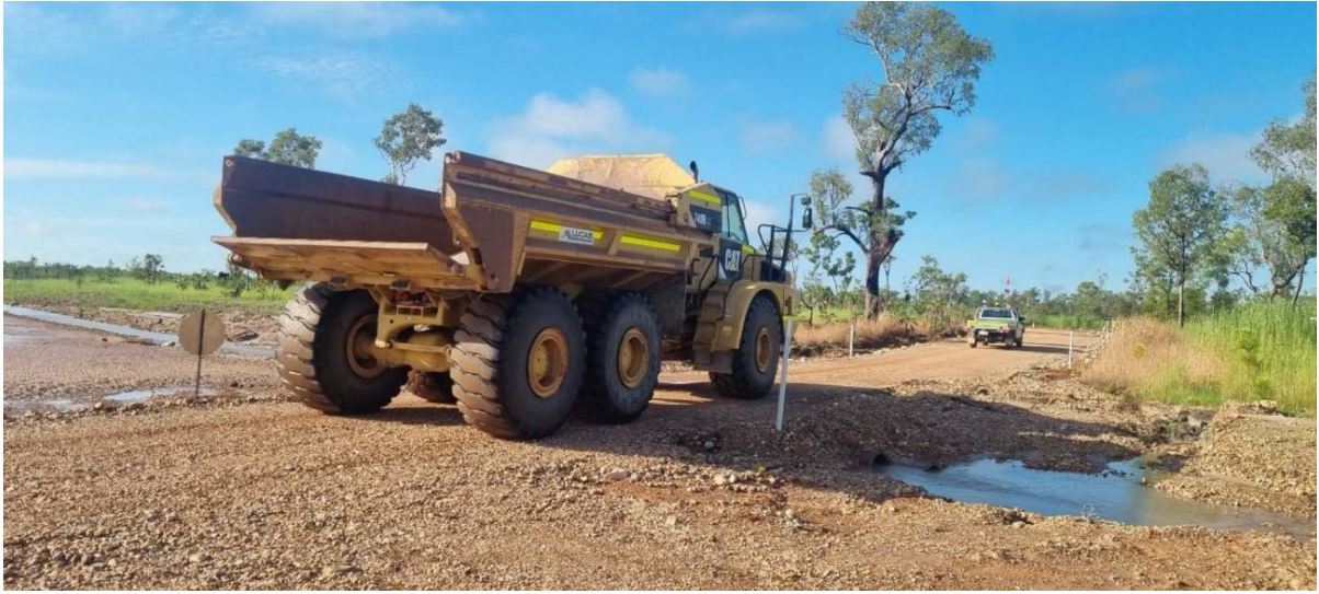
Figure 2. Earthworks underway at the Finnis Project