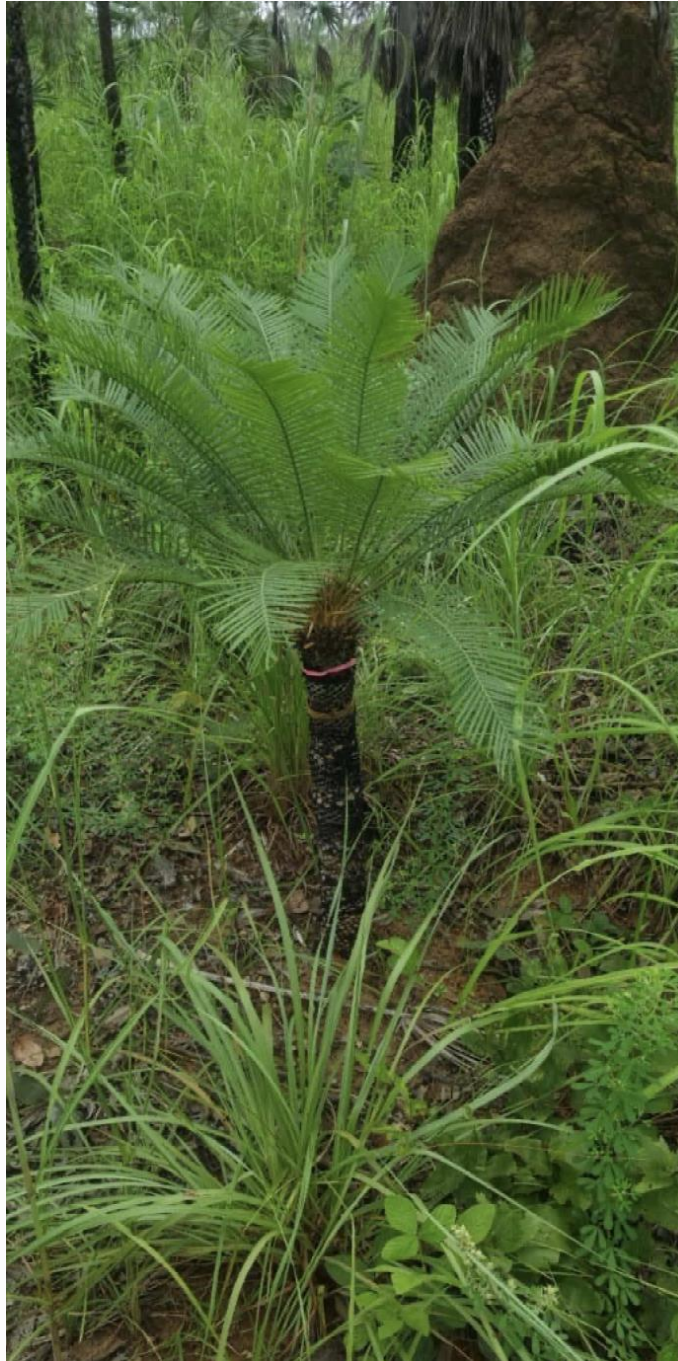
Figure 5. Core's thriving cycads following their relocation

This announcement has been approved for release by the Core Lithium Board.