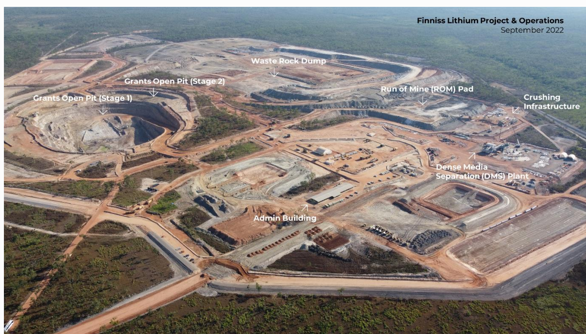
Figure 3. Finnis Lithium Project and Operations Progress (looking south)