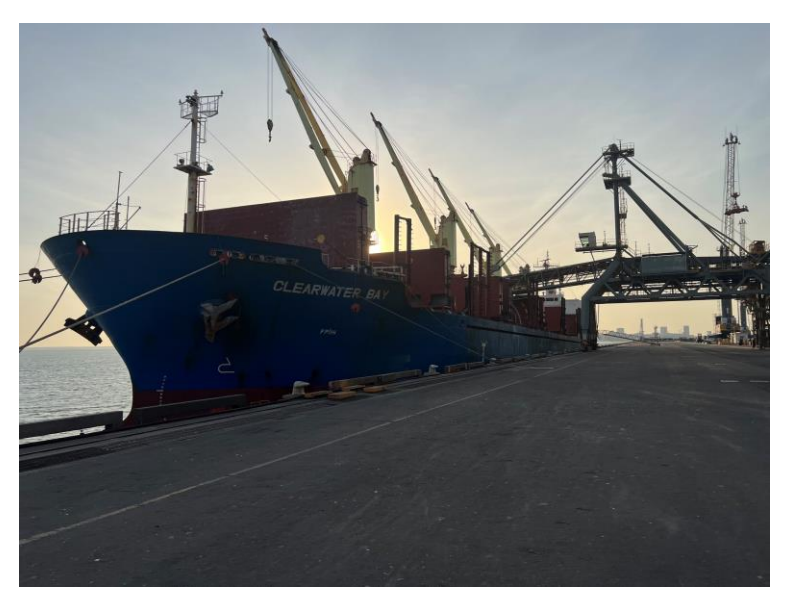
The vessel Clearwater Bay at Darwin Port