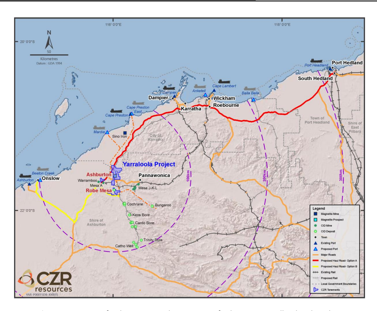
Figure 1 Location of Robe Mesa in relation to port facilities at Pt Hedland and Onslow