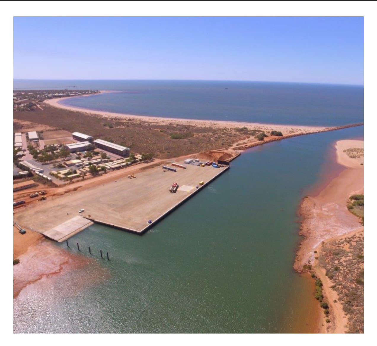
Figure 2 Oblique aerial view of the OMSB Facility at Beadon Creek near Onslow showing the dock-side hard-stand and shipping channel.