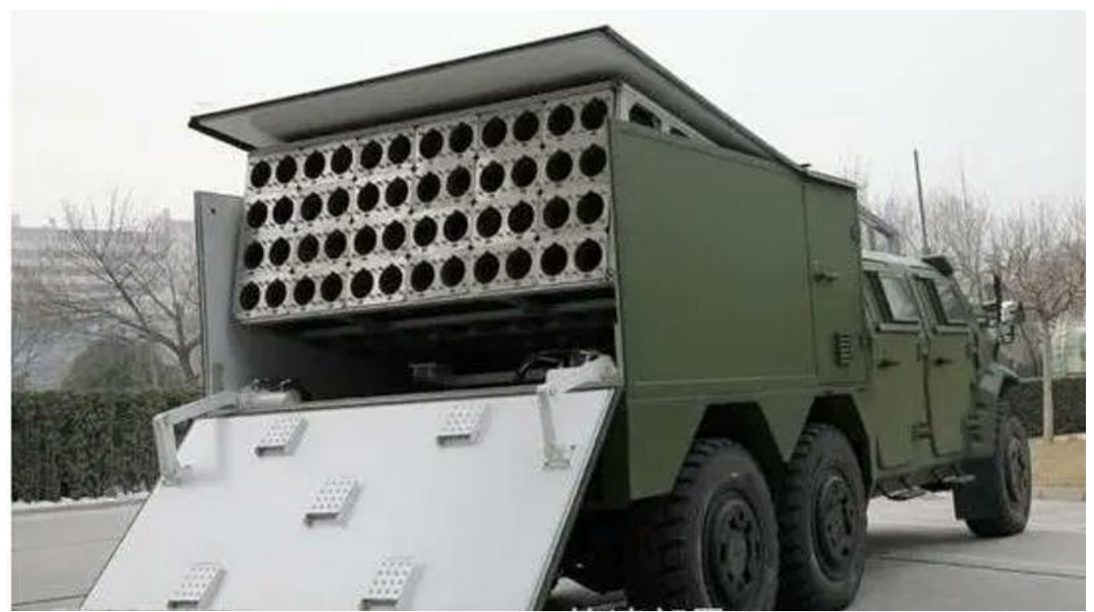
Image: A Chinese UAS/drone fires from a launcher mounted to a Dongfeng Mengshi light tactical vehicle during a swarm UAS test by the China Academy of Electronics and Information Technology (CAEIT) in September

Further in the sovereign small UAS militarised arena, China has unveiled a UAS swarm bombing system, underscoring the rising use of small UAS by the military, including peer and near-peer warfare: