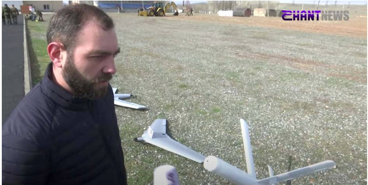
Image: Armenian armed forces interview with kamikaze/loitering munition drones

The conflict also includes Turkey, and Turkish Bayraktar TB2 UAS was shot down by Armenian air defence units during fighting in Nagorno-Karabakh. Armenia has suspended exports of military technology to Turkey after defence officials claimed they had found Canadian-made optical and target acquisition systems on the downed Turkish drone.