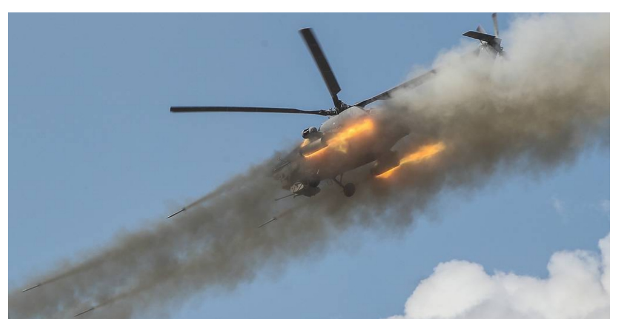
Image: Russian Mi-28NM helicopter with mini-drone/suicide drone capability

During the quarter, Armenia and Azerbaijan recommenced a long simmering conflict in the disputed Nagorno-Karabakh area, with an extensive use of drones by both sides, including small kamikaze/loitering munition drones.