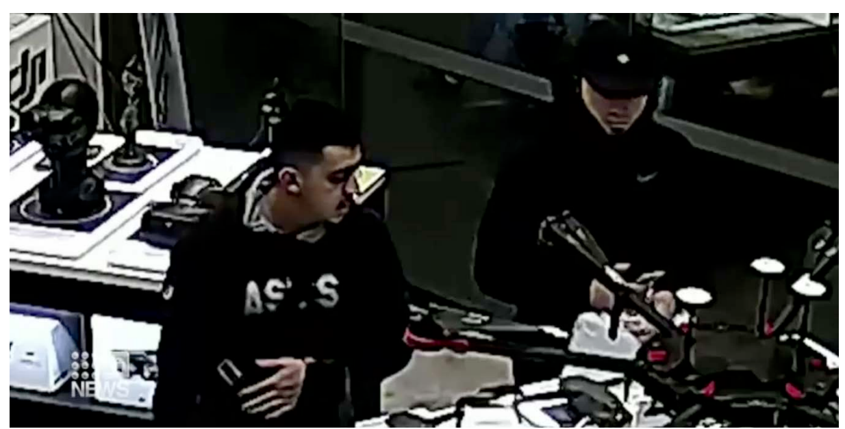
Image: Footage of suspects purchasing a drone for contraband delivery to a Sydney prison