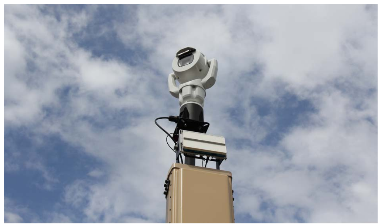
Image: DroneSentry<sup>™</sup> multi-sensor C-UAS system with AI capability

Within the C-UAS space, the AI updates will enhance DroneShield products' current industryleading UAS detection capabilities and ensure effectiveness against emerging threats. As each phase of the Company's AI program is released to customers, DroneShield will provide its customers with seamless software-based upgrades, demonstrating DroneShield's commitment to future proof counterdrone solutions for its customers, ensuring they always have the most capable, up-to-date technologies and 24/7 protection from the emerging and ever-evolving threat that the commercial and consumer commercial-off-the-shelf (COTS) and modified (MOTS) drones can present.