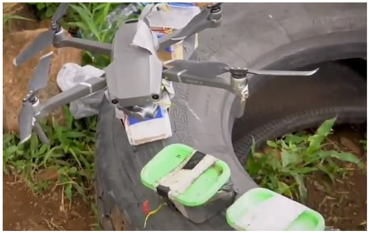
Image: drones with C4 explosive and pellets found in in Tepalcatepec, Mexico