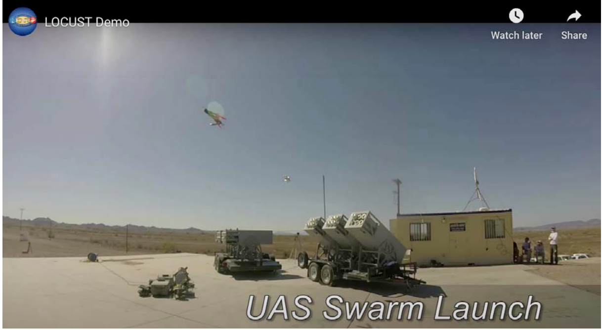
Image: US Navy Low-Cost UAV Swarming Technology (LOCUST) demonstration

This test was similar to the multi-tube trail-mounted launchers that the U.S. Navy's Office of Naval Research used to launch Coyotes as part of its recent Low-Cost UAV Swarming Technology (LOCUST) effort: