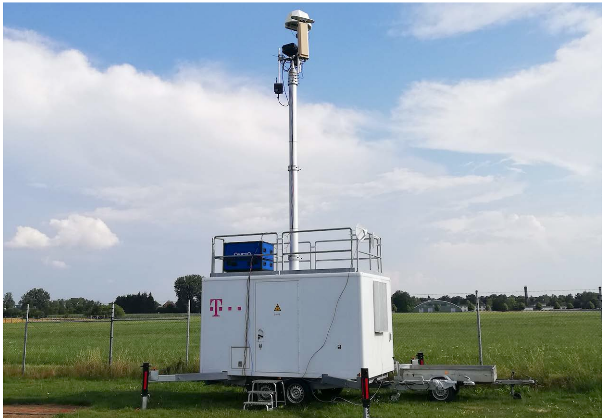
Image: DroneShield system deployed at German airport trial, run by DroneShield's partner Deutsche Telekom

During the quarter, DroneShield continued trial deployments at multiple European airports, ahead of expected procurements in first half of 2021. This has included a long-term showcase demo deployment at the Altenrhein Airport in Switzerland, which has agreed to be a showcase for other airports. Due to its smaller size, it is able to act both as a reference case and a visit site for other airports seeking to see a system deployed at a working airport, which can often be more difficult at a larger facility due to security and other access protocols in place.