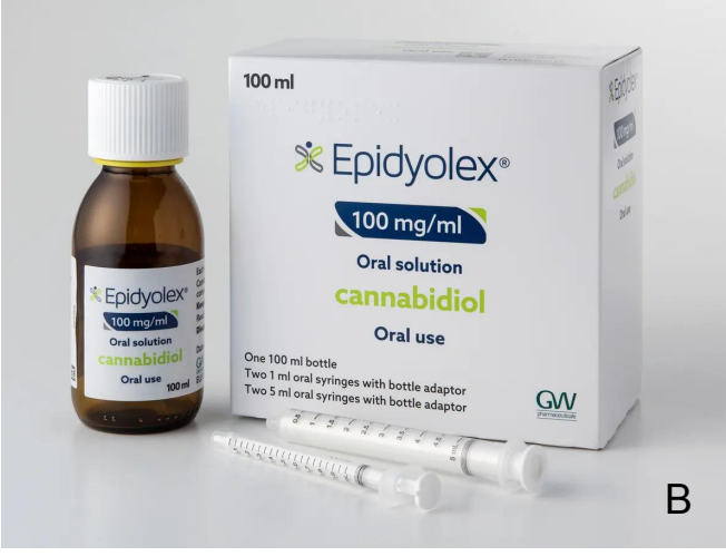
Figure 2: [A] EMD-RX5 "ultra-pure CBD" capsules and [B] Epidyolex CBD oil