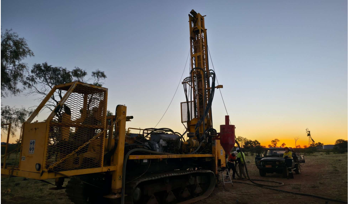
Figure 2: Preparations underway to drill at Cattle Creek (20 April 2026)

Contractor Johannsen Drilling Pty Ltd of Alice Springs commenced drilling, refer Figure 2. Air-core drilling is being used to pre-collar the holes through alluvial sands, saprolite and clays that overlay the gneiss granite bedrock. Diamond coring will be used to penetrate the granite and recover intact core. Enova's team is overseeing operations and will be responsible for sampling and geological controls.