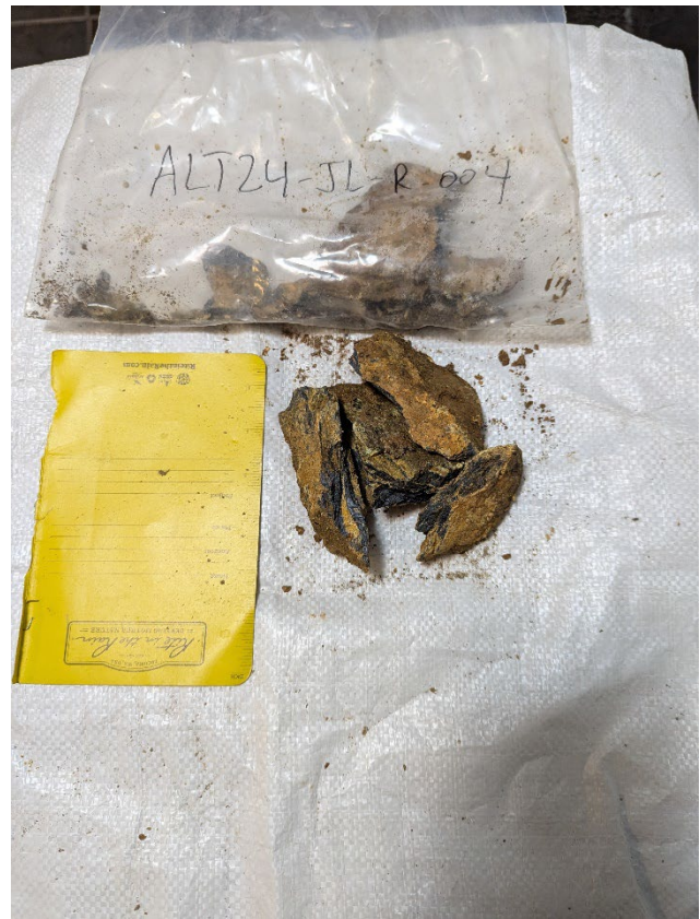
Figure 4 67.96% Antimony rock chip collected from the mineralized zone (ALT24-JL-R-004)