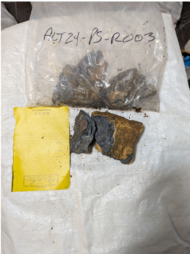
Figure 3 69.98% Antimony rock chip collected from the mineralized zone (ALT24-PS-R003)

From an initial set of 26 rock chip samples collected from the Alturas Antimony Project, 14 samples have returned significant antimony (Sb) concentrations above 10%. Full details are included in Annex 1.