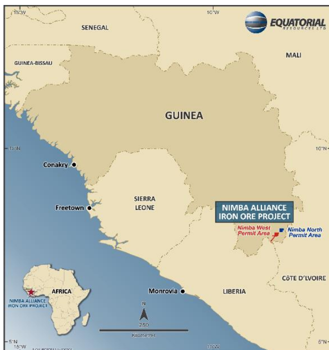
Figure 2 - Nimba Alliance Iron Ore Project Location