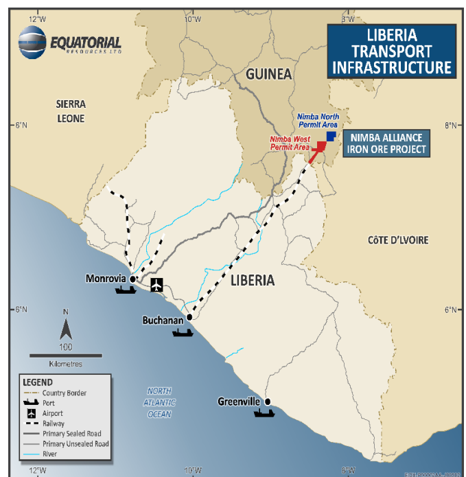
Figure 3 – Liberian Transport Corridor