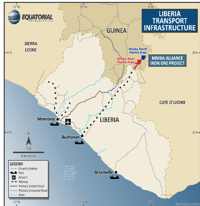
Figure 2 – Liberian Transport Corridor

Five significant high priority (refer Figure 3), near surface iron ore targets identified, with a total strike potential of approximately 55km, comprising friable itabirite, compact magnetite, and detrital “canga” mineralisation.