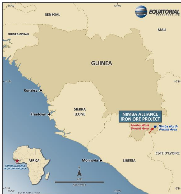
Figure 1 – Nimba Alliance Iron Ore Project Location

The Nimba Project is located within a cluster of major iron ore projects where the development of large scale transport infrastructure to enable efficient economic production is ongoing.