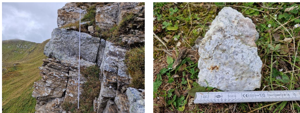
Figure 2 – Outcrop and pick sample from Bretstein-Lachtal Project.

A reconnaissance campaign completed by Richmond Minerals in the summer of 2022 revealed multiple pegmatite bodies in the Bretstein-Lachtal Project area and confirms the descriptions of Mali (2004). Spodumene pegmatite veins were observed up to a meter thickness with spodumene crystals up to 10 cm size . Geochemical results from grab rock chip samples indicate prospective spodumene pegmatites with \text{Li}_2\text{O} grades ranging from 0.51 to 2.67% (Table 1 and Figure 2).