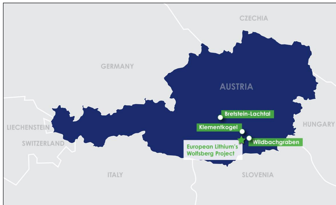
Figure 1 – Austrian Lithium Projects location.

The Austrian Lithium Projects are hosted by comparable, prospective geological units as EUR's Wolfsberg Lithium Project and show a similar vein type mineralisation with spodumene as the main lithium bearing mineral.