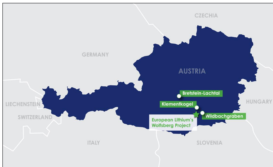
Figure 2 – Austrian Lithium Projects location.

that is considered prospective for lithium occurrences in the Styria mining district of Austria (refer Figure 2).