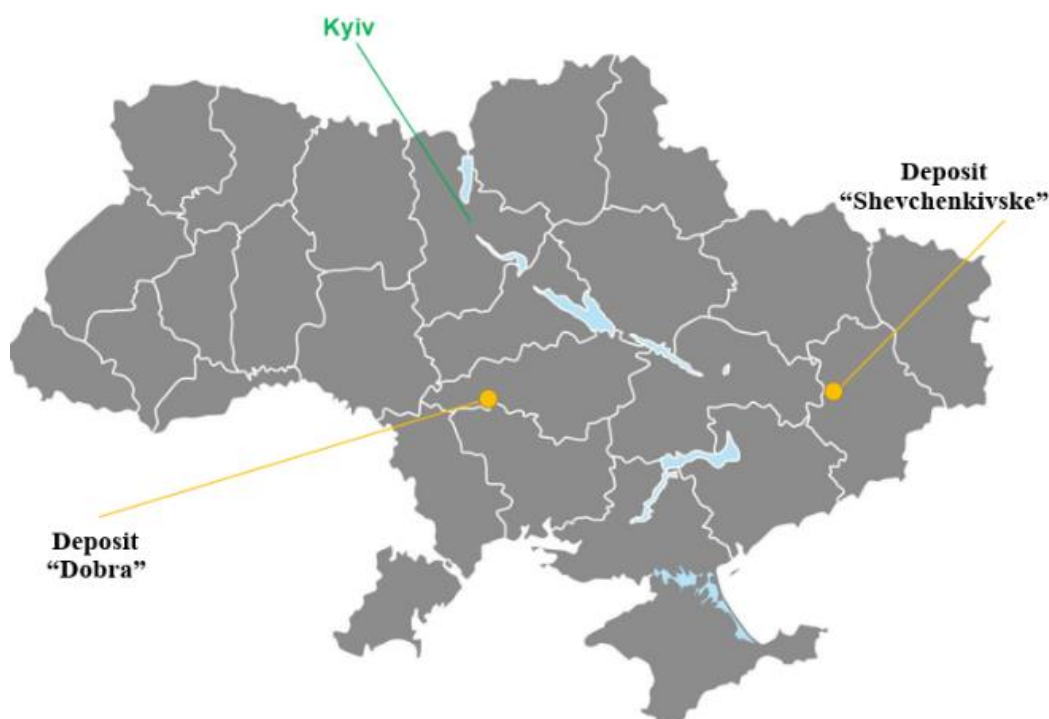
Figure 4 - Location of the deposit Shevchenkivske and Dobra in Ukraine

On 28 February 2023, the Company announced that it had renegotiated the terms under which EUR will acquire European Lithium Ukraine LLC (formerly Petro Consulting LLC) ( European Lithium Ukraine ), a Ukraine incorporated company that is applying (through either court proceedings, public auction and/or production sharing agreement with the Ukraine Government) for 20-year special permits for the extraction and production of lithium at the Shevchenkivske project and Dobra Project in Ukraine (refer figure 4), from Millstone and Company Global DW LLC ( Millstone )( Millstone Transaction ).