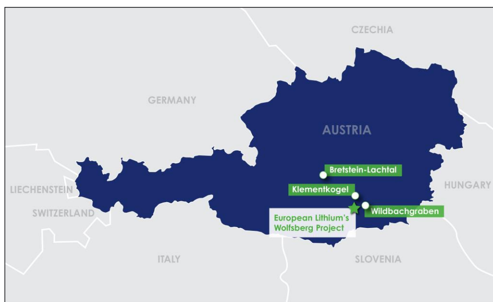
Figure 2 – Austrian Lithium Projects location.

The Austrian Lithium Projects consist of 245 exploration licenses covering a total area of 114.6 km 2 and are located approximately 80km from the Wolfsberg Lithium Project (refer Figure 2). The licenses cover ground that is considered prospective for lithium occurrences in the Styria mining district of Austria, approximately 70km north of the Company's Wolfsberg Project.