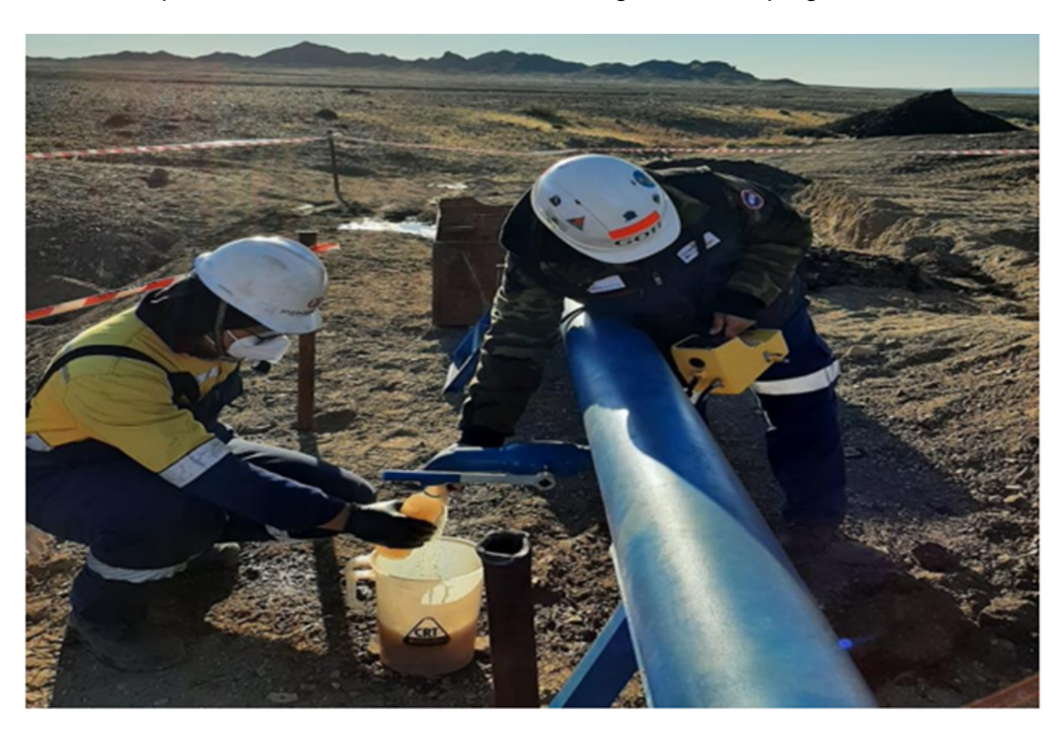
Gas testing and water sample gathering at Nomgon 6

The extensive information gathered from this well will now feed directly into the planning for a long term pilot production testing program planned for 2022, which is currently underway. The Nomgon 6 well has been suspended and will be used as a monitoring well in that program.