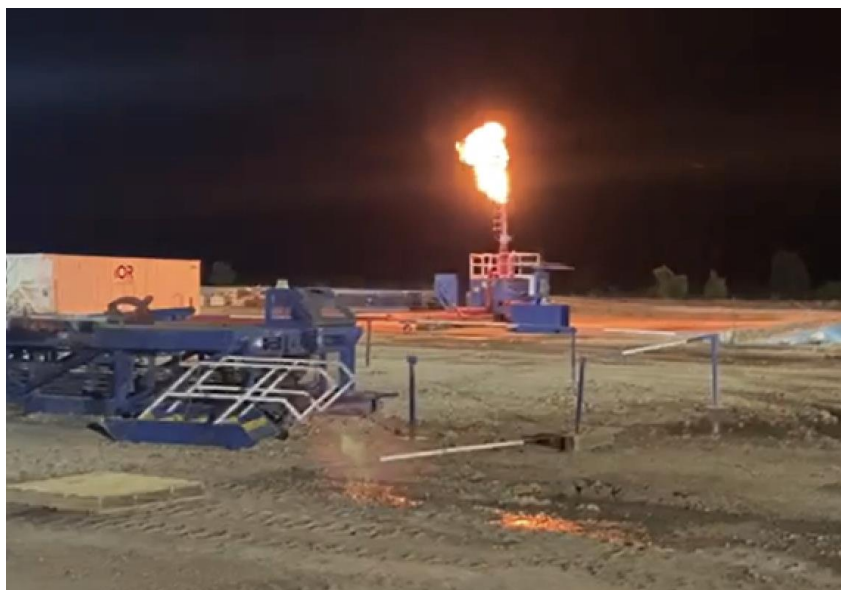
Flare at Daydream-2

An unexpected naturally permeable gas bearing zone has been discovered – with gas flowed to surface without stimulation: