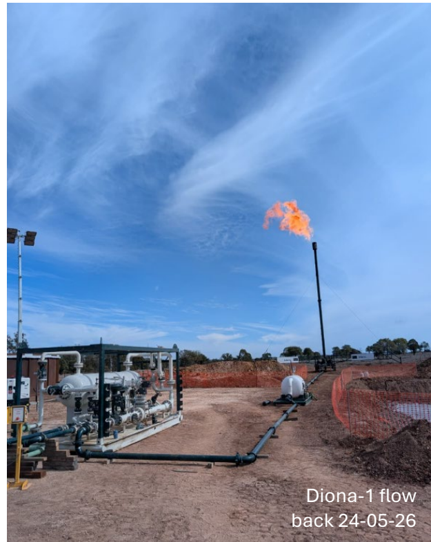
Diona-1 flow back 24-05-26

D1 has flowed back approximately 46% of its total injected fluid, however the well has been unable to naturally complete this process in order to reach the 50-60% fluid recovery target. Diona-1 has been cycled over the past week in order to slug fluids to surface, this process whilst consistently producing gas at near-zero impurity levels, has been unable to move the well into stabilised recovery due to the volume of returning stimulation fluid (a positive for reservoir connectivity) which has been confirmed by echo meter measurements and salinities of the produced fluids. Shut-in well head pressure is currently measured at ~1,600 psi and will be monitored along with well bore fluid levels via additional echo meter measurements while the demobilisation of non-essential equipment takes place to reduce the cost profile at Diona.