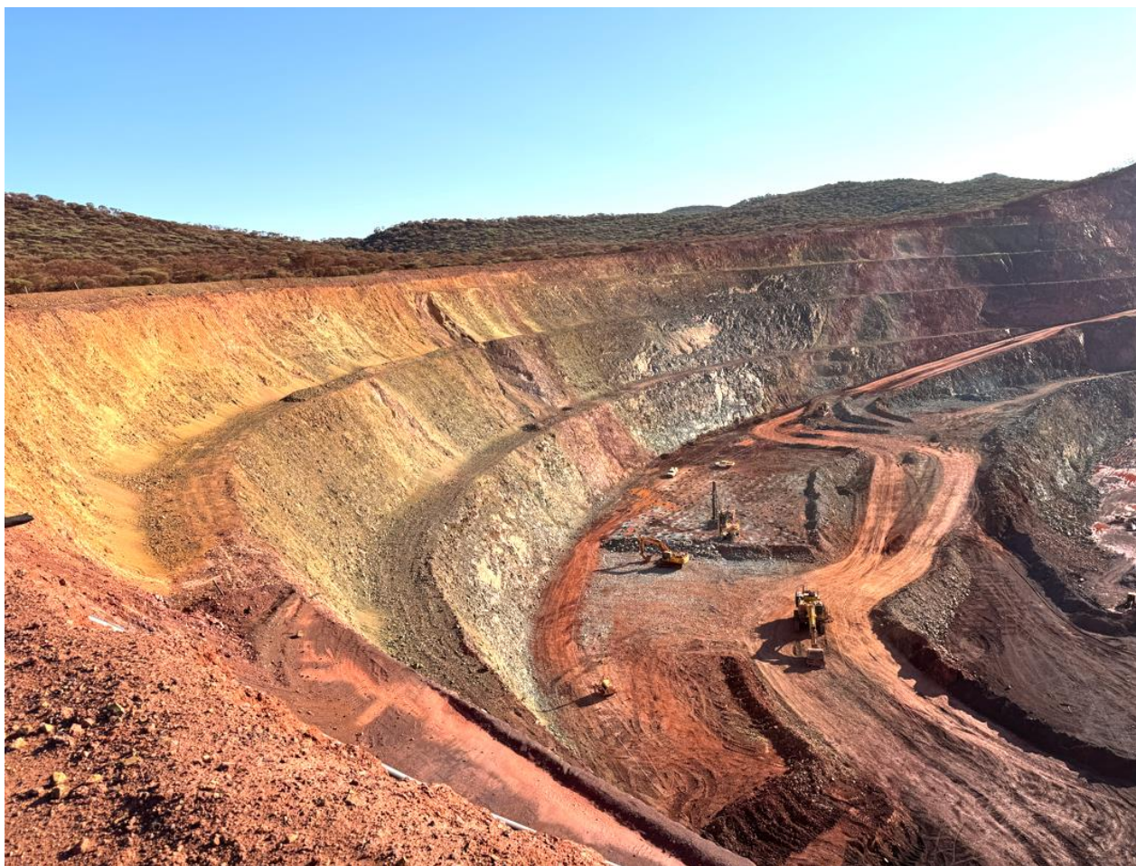
Fenix's 100% owned Iron Ridge Iron Ore Mine – October 2024

Fenix will host a live investor briefing on Thursday, 24 October 2024 at 9:15am AWST / 12:15pm AEDT . Register here: https://bit.ly/3BPWKTH