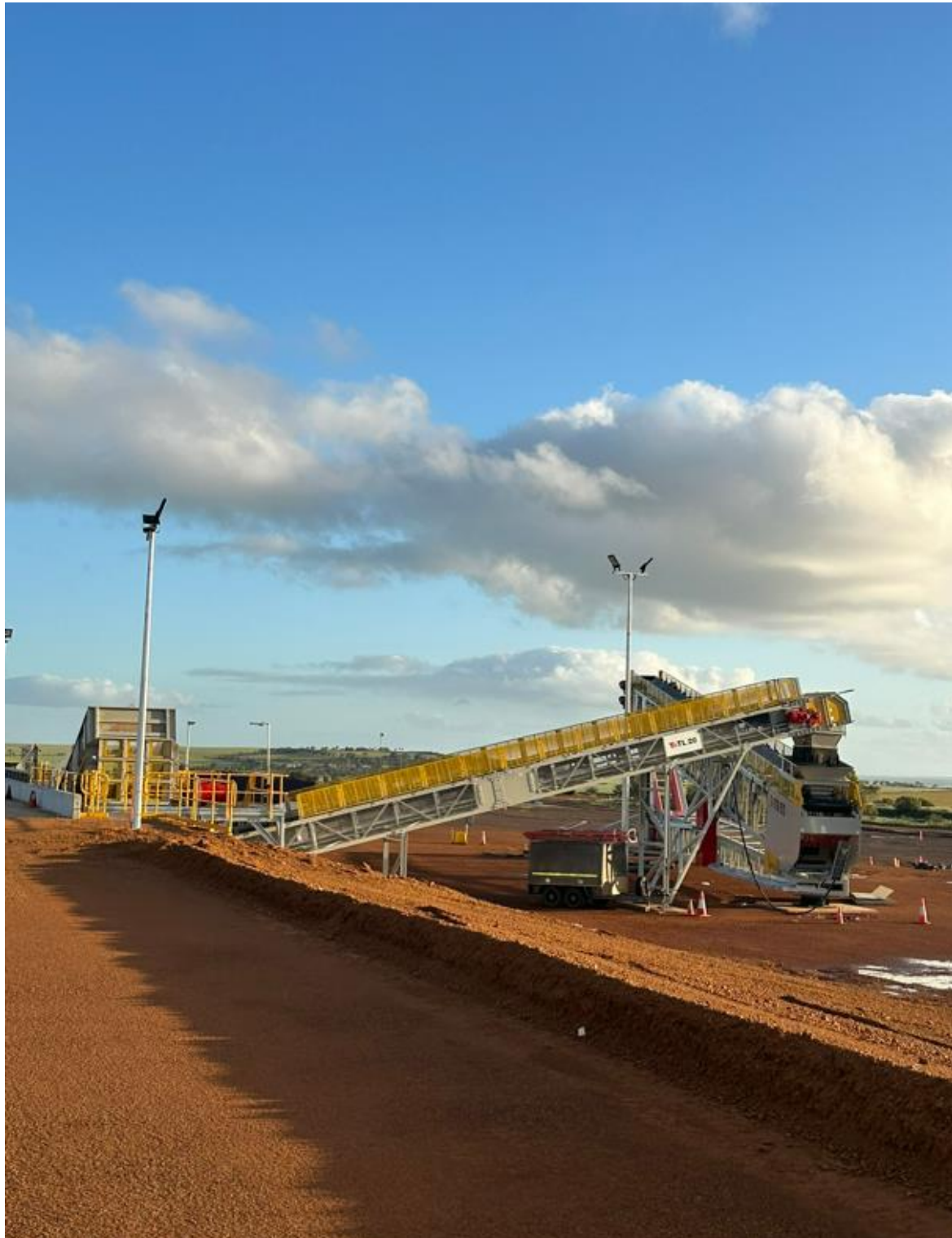
Ruvidini Inland Port Construction – September 2024

Fenix continues to explore future opportunities to extend the Company's logistics offering to include rail haulage solutions as a means to bolster future revenue opportunities for both Fenix-owned product as well as third-party producers seeking to export through the Port of Geraldton.