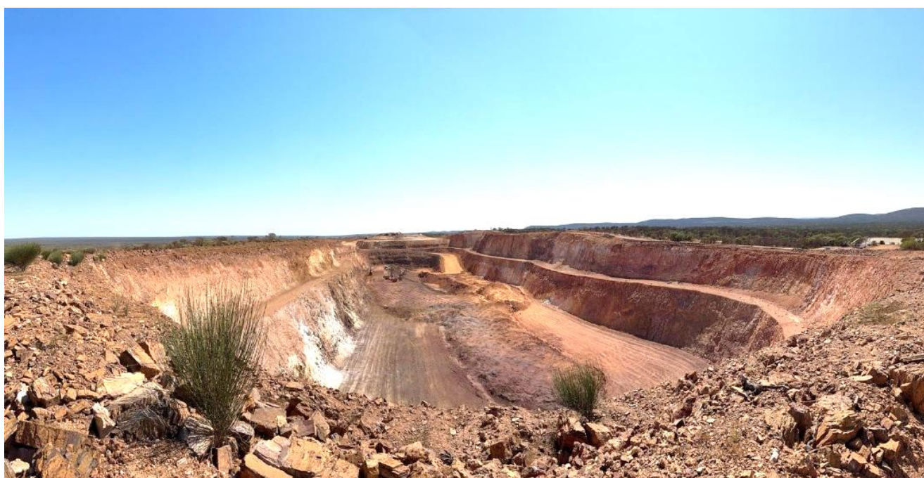
Fenix's 100% owned Shine Iron Ore Mine – September 2024

The Company finished the period with A$72.0 million in cash, post deployment of A$11.1 million in cash to advance the Company's growth projects (including the Ruvidini Inland Port, Shine Iron Ore Mine, and Beebyn-W11), negative quotation period adjustments of A$3.1 million, and payment of taxes and royalties during the period of a further A$6.8 million, partially offset by net receipts from hedging of A$2.2 million. The Fenix team remains focused on developing its pipeline of growth projects whilst continuing the strong mining performance at Iron Ridge, ramping up production from Shine and commencing production from Beebyn-W11. The team continues to evaluate a number of new opportunities aimed at growing the operational footprint across the mining, logistics and port services businesses.