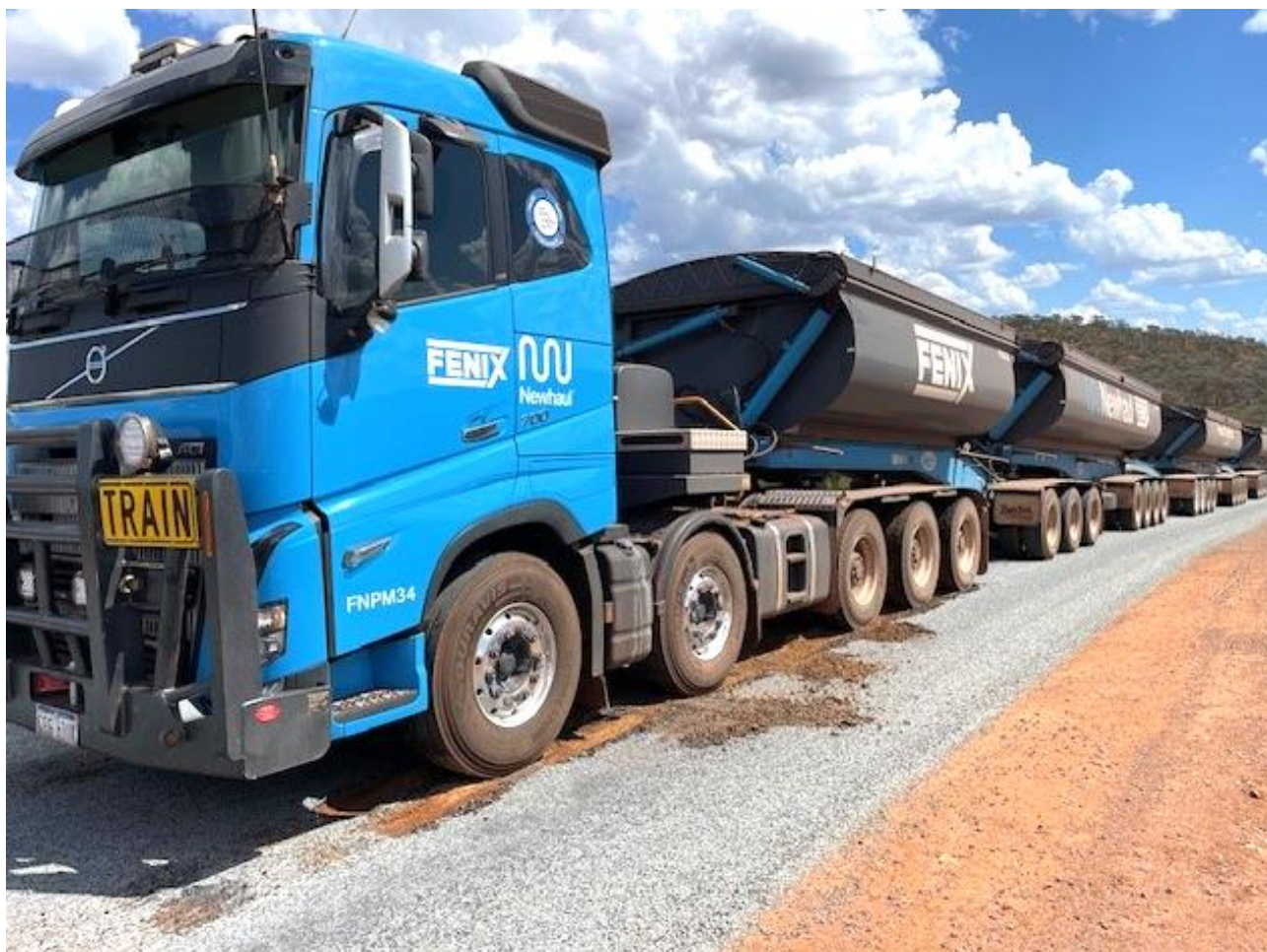
Fenix's Newhaul Road Logistics quad road train at the Shine Iron Ore Mine – September 2024

Newhaul Road Logistics continued to expand its fleet during the quarter as part of the planned ramp up production at the Shine Iron Ore Mine, as well as planned developments at the Beebyn-W11 Iron Ore Mine, Ruvidini Inland Port and in anticipation of securing additional third-party haulage contracts.