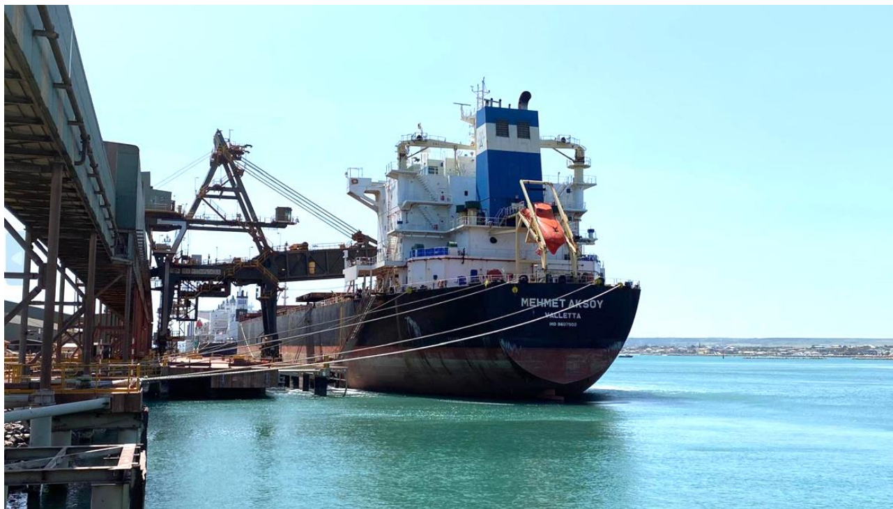
Fenix successfully shipped its 5 millionth tonne from Iron Ridge on the Mehmet Aksoy during September 2024

The Company expects to continue to boost export volumes during the upcoming quarters as a result of the Gold Valley contract noted above, as well as through shipment volumes from the Shine Iron Ore Mine that recently commenced production and haulage.