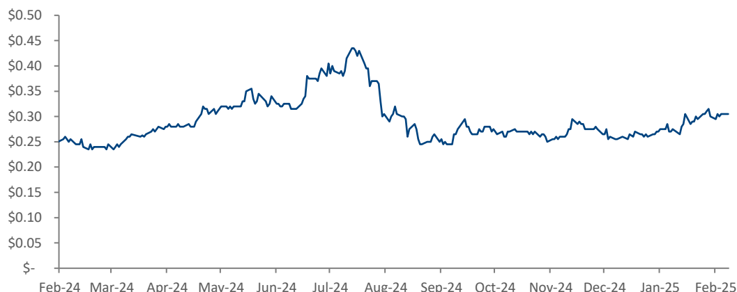
Fenix (ASX:FEX) daily closing price ($ps)

The following chart shows the closing price of Fenix on ASX over the 12-month period up to and including the Last Practicable Date.