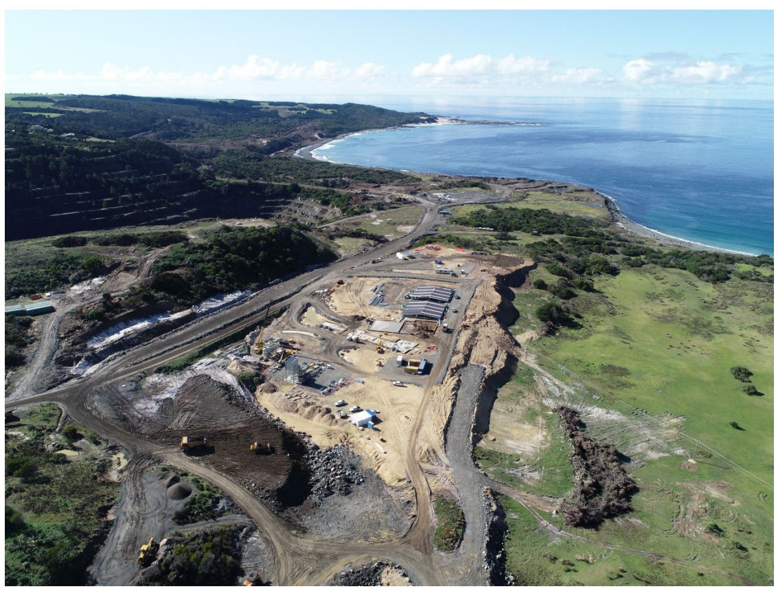
Figure 1 - Arial Photo of Process Plant Area (Looking North-East)

Development of the overall site is progressing well, with the haul and access roads being further developed to improve access to the process plant area for mechanical installation works. The ROM pad earthworks & wall are progressing steadily, which are set 10m above the ground level of the process plant.