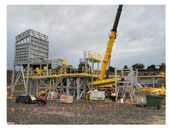
Figure 2 - Installation of Primary and Secondary Crushing Equipment

installation of equipment. Most of the major OEM equipment has been delivered to site or is undergoing testing at Gekko's factory at Ballarat, ahead of being delivered to site.