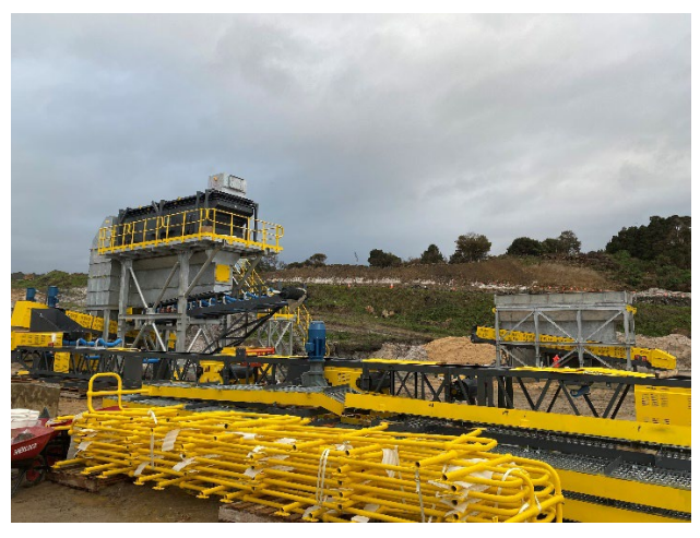
Figure 3 - Installation of Secondary Screen