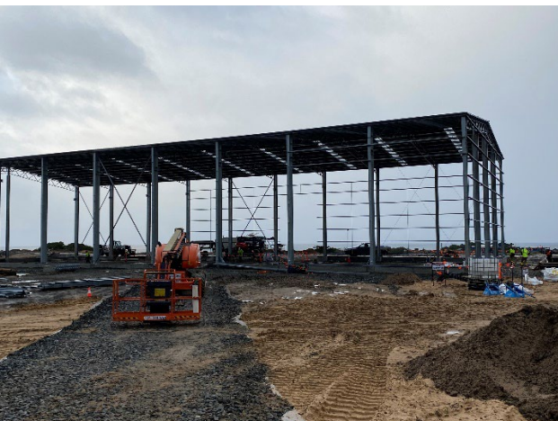
Figure 5 - Erection of Main Process Building

Works have commenced on the construction of the Tailing Storage Facility, with vegetation clearance complete and earthworks ongoing in preparation for construction of the TSF walls. The TSF is being constructed on the historic TSF site, minimising disturbance to virgin vegetation, and using materials that are being reclaimed from the proposed mine pit shell.