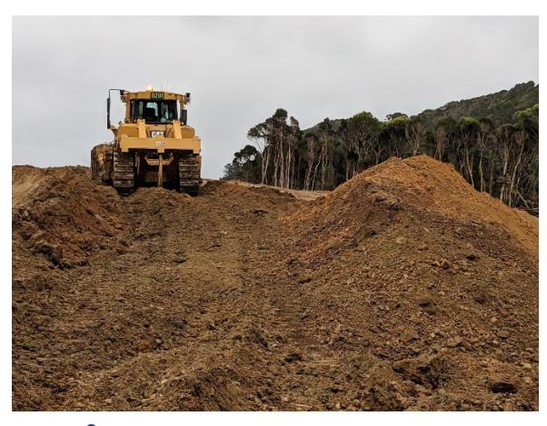
Figure 6 - Earthworks for Tailings Storage Facility