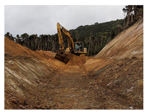
Figure 7 - Earthworks for Tailings Storage Facility