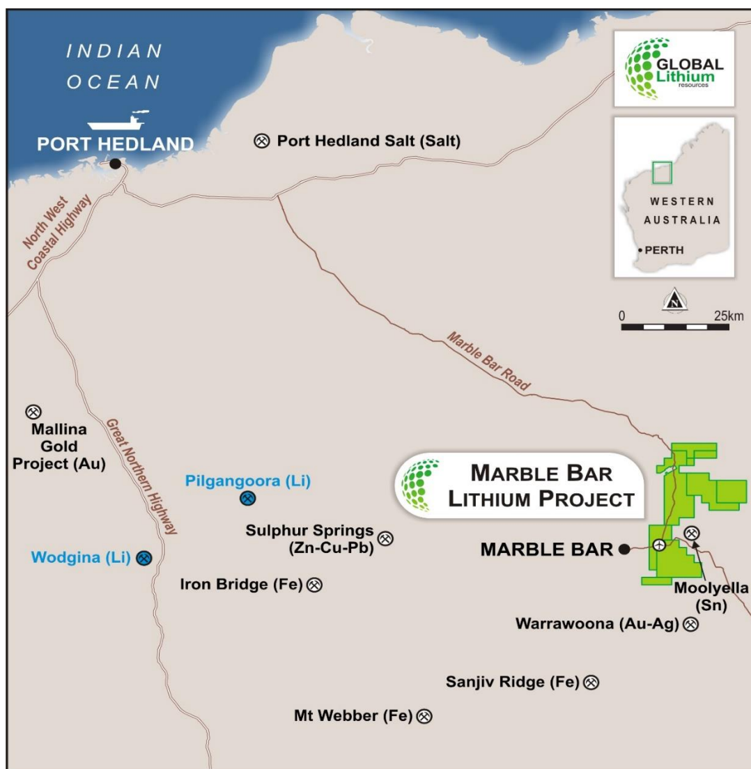
Figure 3 – Marble Bar Lithium Project location map.

As of 31 March 2022, Global Lithium is well funded with a cash balance of A$36 million (refer 27 April 2022 ASX announcement "Quarterly Activities/Appendix 5B Cash Flow Report").