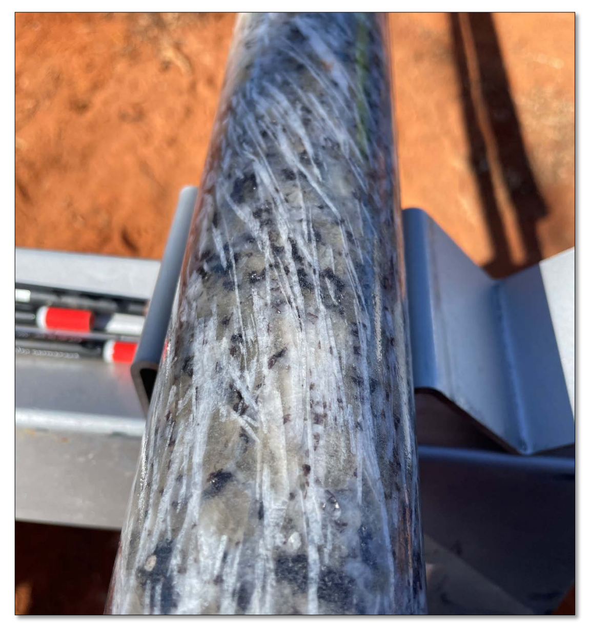
Figure 4. Image of the Manna Pegmatite showing spodumene crystals throughout the core.

Cautionary Statement: Preliminary visual observations of the drill core surface as presented above are not considered to be a proxy or substitute for laboratory analyses where metal concentrations or grades are the factor of principal economic interest.