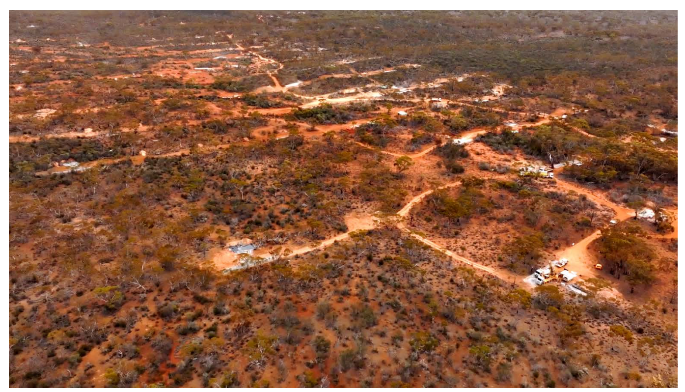
Figure 1. Aerial image showing the southern half of the Manna Lithium Project drilling program.

The DD campaign has completed its program of collecting sufficient core samples for a full metallurgical test program. The core is being fast tracked through processing and assay to be available for sample selection and metallurgical testing beginning early 2023.