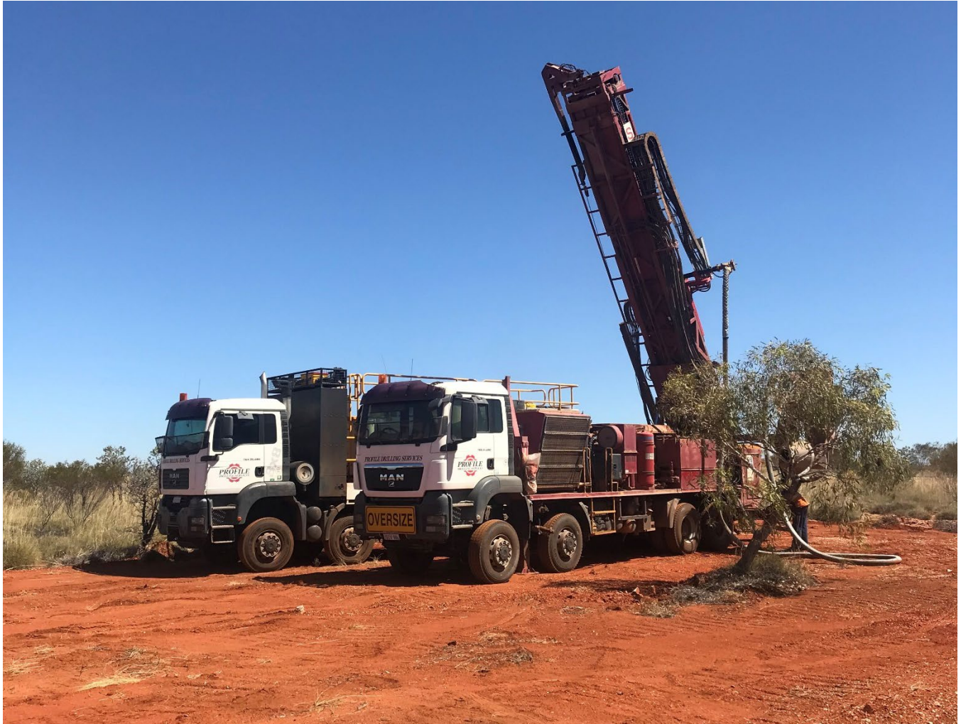
Figure 2. Profile Drilling, Rig 1 setup to start drilling at the Marble Bar Lithium Project.

“I am pleased GL1 has commenced the CY2023 exploration program at the 100% owned Marble Bar Lithium Project. We have only explored about 6km of the projected 25km lithium prospective strike length, so I believe that MBLP could hold additional lithium discoveries as we progress exploration further. Also, being able to explore the potential of the Twin Veins gold and base metal anomaly in this year’s program is very exciting and I look forward to providing regular updates as results become available.”