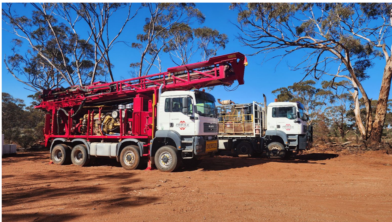
Figure 3. Profile RC rig on site at the Manna Lithium Project.