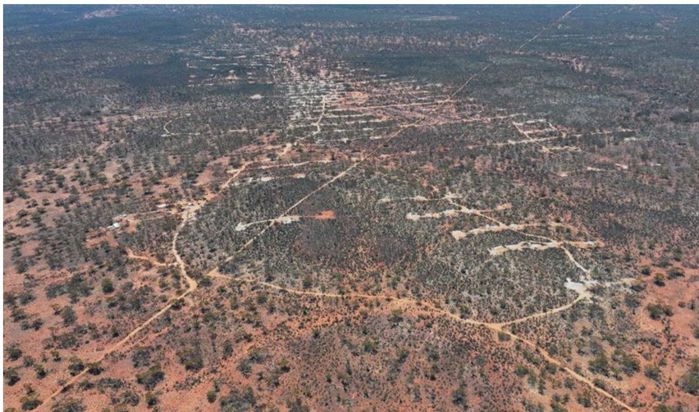
Figure 2. Manna Lithium Project drilling (aerial northeast view).