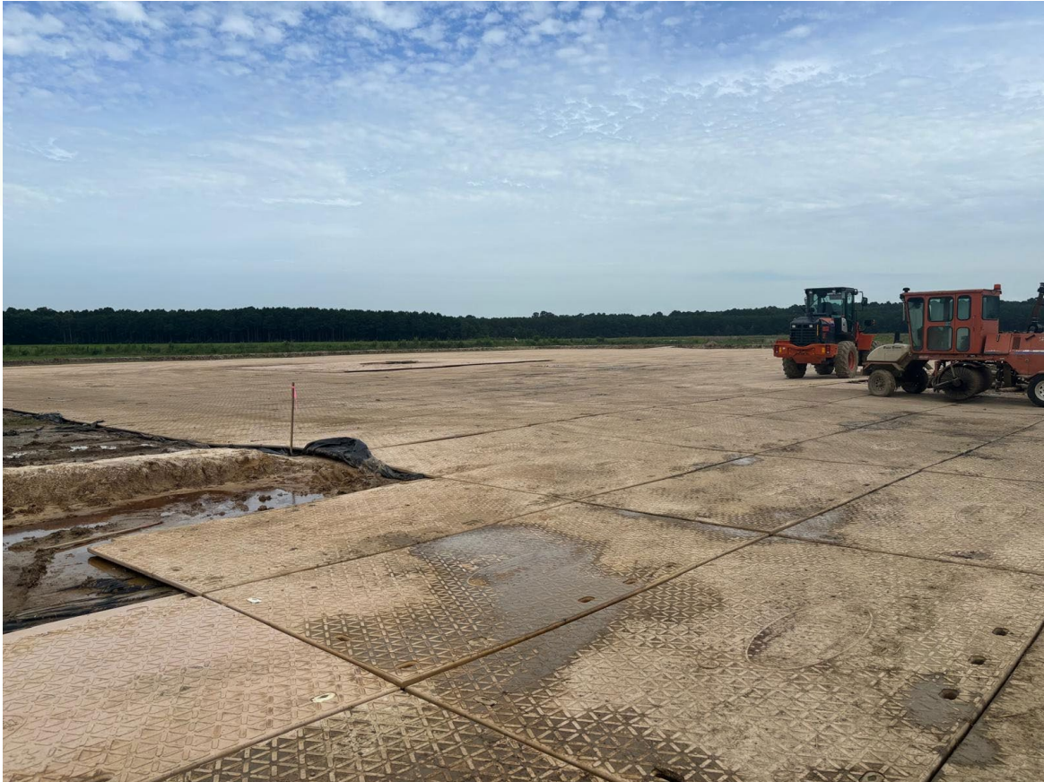
Figure 1: Completed Drill Pad at Zydeco-1 well

Construction of the Zydeco-1 drilling site in Acadia Parish, Louisiana, has been completed.