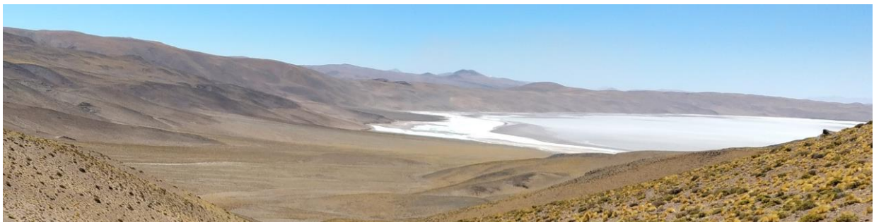
Figure 3: HMW Project looking north from Pata Pila

Hombre Muerto West (HMW): a ~14km by 1-5km region on the west coast of Hombre Muerto salar neighbouring Livent Corp to the east. HMW is currently comprised of seven concessions – Pata Pila, Rana de Sal, Deceo III, Del Condor, Pucara, Catalina and Santa Barbara. Geophysics and drilling at HMW demonstrated a significant potential of a deep basin. In March 2020, a maiden resource estimate delivered 1.1Mt of LCE for two of the largest concessions (Pata Pila and Rana de Sal). That resource now sits at 2.3Mt of LCE with exploration upside remaining for the rest of the HMW concessions not included in the current indicated resource.