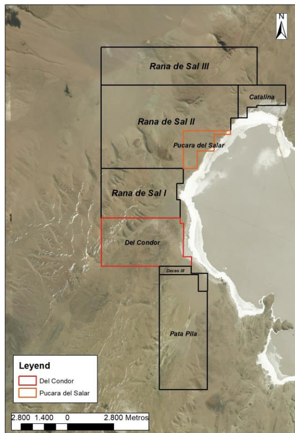
Figure 1: Galan Lithium Ltd's key Western Basin tenure, Hombre Muerto Salar Argentina