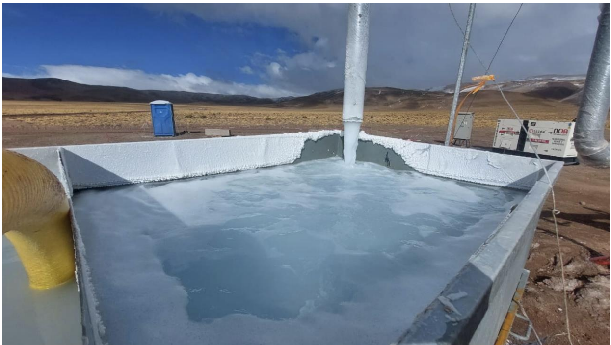
Figure 2 – Brine discharge at PBPP-01-21 during long term pumping test.

The Galan Board has authorised this release.