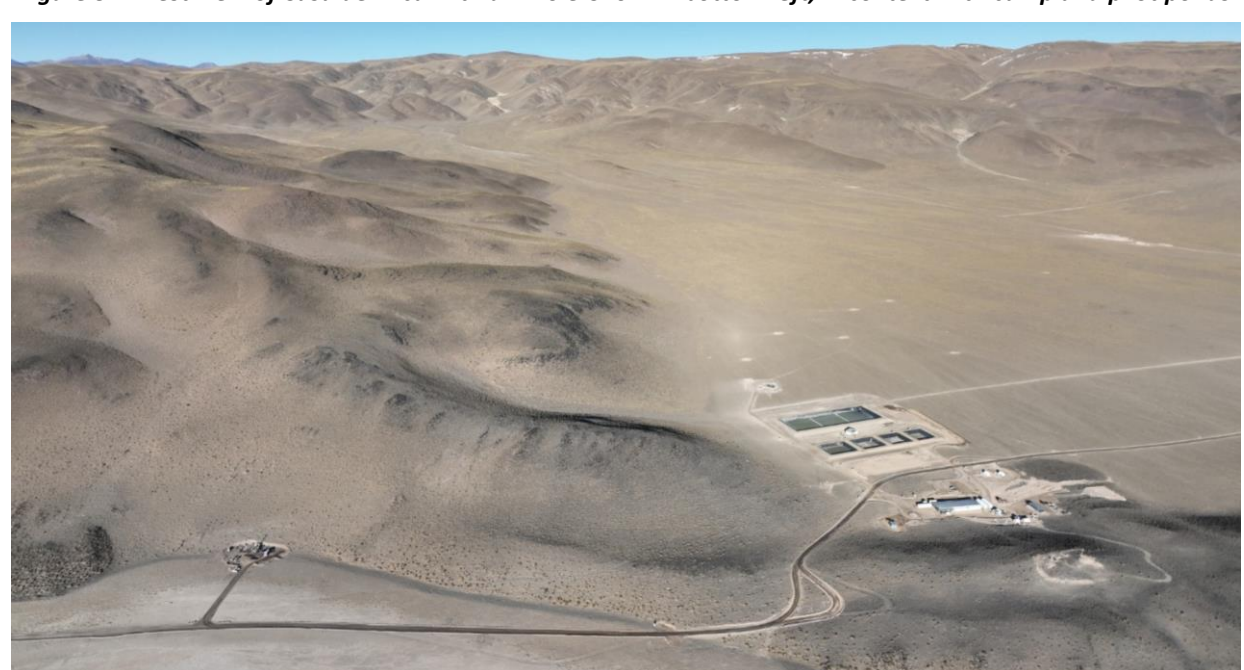
Figure 3 – West view of Casa del Inca with drillhole CI-01-22 bottom left, in context with camp and pilot ponds

Drilling at CI-01-22 shows a fractured basalt unit overlying unconsolidated sands and gravels. The drillhole was completed to a depth of 155m. Following the finalization of CI-01-22, drilling will commence in del Condor (DC-01-22; see Figure 1) with the aim of improving certainty in the area connecting Rana de Sal and Pata Pila for the updated resource.