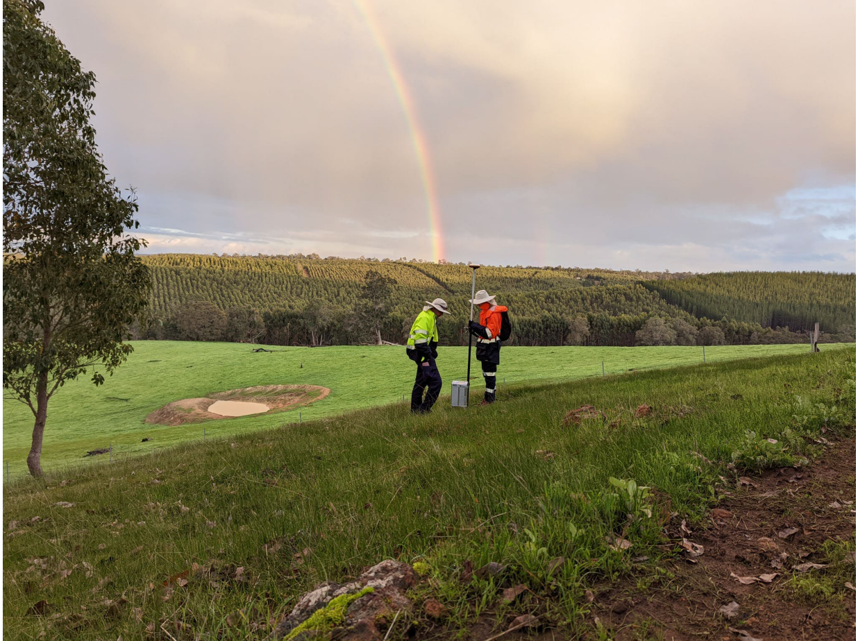
Figure 2: Fieldwork being conducted in Greenbushes South.