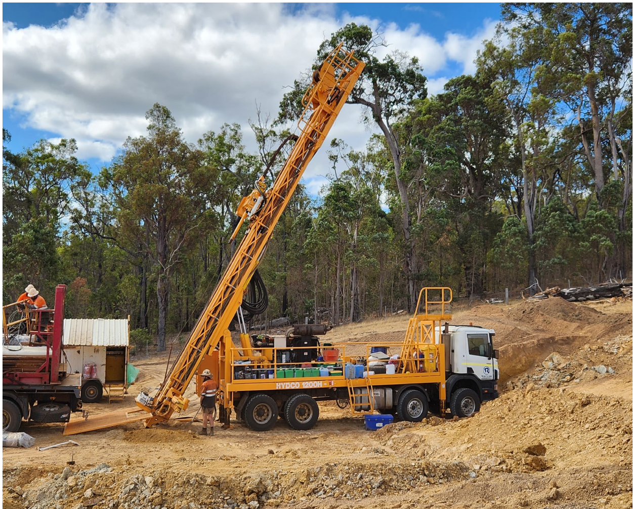
Figure 1: Drilling underway at 100% owned Greenbushes South Lithium Project

This maiden 2,500-metre drilling campaign is testing Galan's targets identified from soil sampling and ground geophysics. The Company's team on site have noted multiple minerals associated with lithium-bearing pegmatites close to the surface. These results, along with the proximity to the Greenbushes Mine and to the mineralising Donny-Brook Bridgetown Shear Zone are very encouraging.