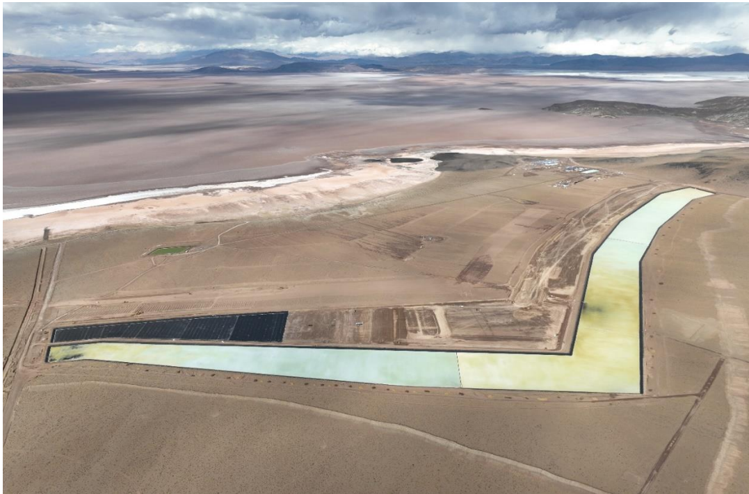
Figure 3 – Overview of HMW Phase 1 project construction with the filling of Pond 1 in the foreground