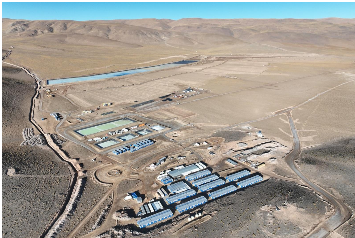
Figure 2 – Overview of HMW Phase 1 project construction (includes camp, pilot plant and filling of Pond 1 in the background)