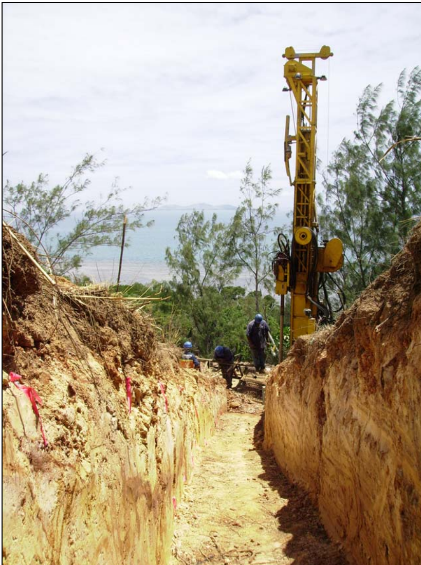
Figure 2. Drill rig at hole FAD017 beside trench FT2 at Faddy's Gold Deposit