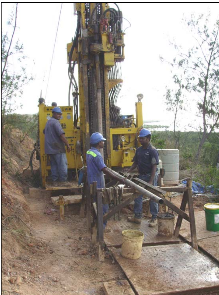
Figure 2. Drill rig at FAD017A, Faddy's Gold Deposit, view towards the south west.

Sampling of the bonanza grade interval in diamond hole FAD019 (12-14m of 90.0g/t gold) was by selection of whole, HQ size, triple tube drill core over 0.5m intervals. Three replicate assays were undertaken on two separate splits of pulp sample on each 0.5m sampled interval (Table 2) and the reported gold values are the averaged data of each of the six assays on individual 0.5m samples. Repeated assays are within expected variability for this type of deposit.