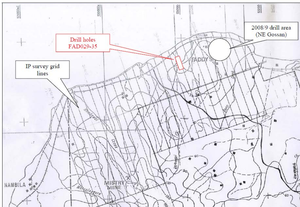
Figure 3. IP Survey grid area showing location of drill holes FAD029-35

Elliot Geophysics International Pty Ltd of Western Australia have been contracted to undertake an Induced Polarization (IP) survey (dipole-dipole) over the new grid covering the Faddy's and the old Mistry Mine (Figure 3). The geophysical crew commenced surveying at the eastern end of the grid in the last week of March and are expected to complete the work and provide preliminary results in early May.