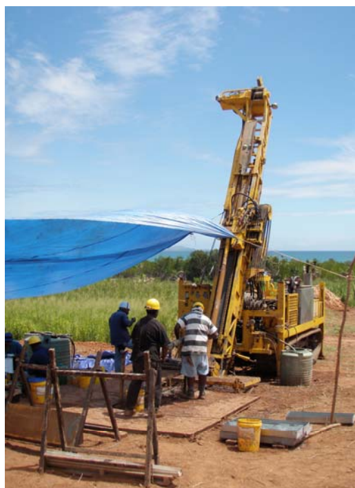
Recent photograph of the drilling rig in operation at the Faddy's Gold Deposit