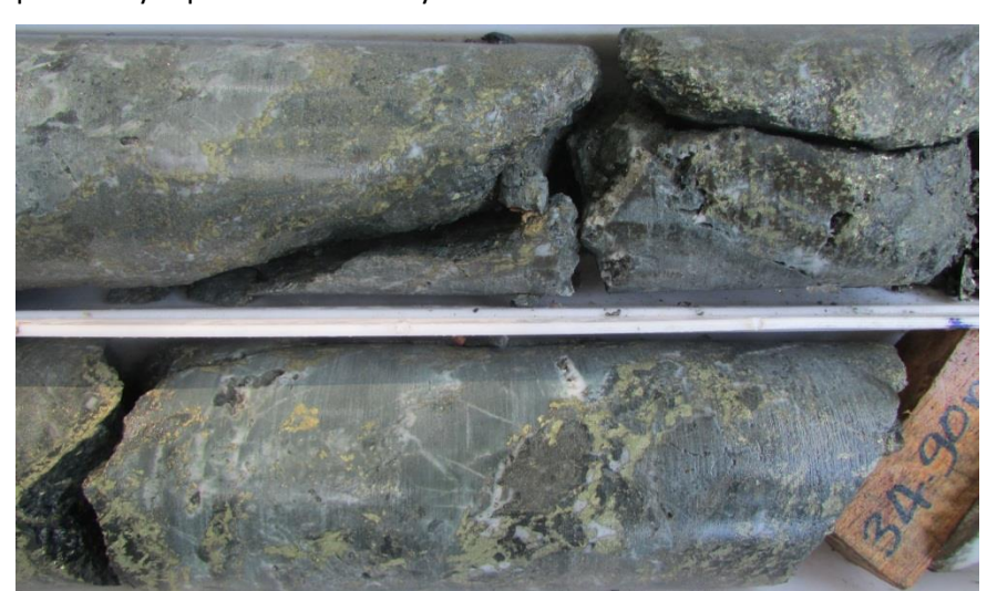
Figure 1: Au and Cu-sulphide mineralised core from a 0.6m intersect grading 93.2g/t Au & 5.18% Cu from 34.6m.

GPR today reports the first gold assays of 3.9m at 16.47g/t gold from the first diamond hole (KDH002) drilled into Prospect 150. Copper grades of 3.1% (based on portable XRF "pXRF" analysis) at Prospect 150 were previously reported in February.