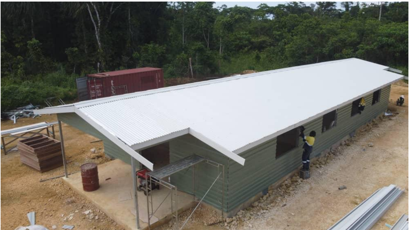
Figure 3: Community school dormitory under construction

A key milestone during the quarter was the finalisation and execution of a Relocation Amendment Agreement in relation to updated house designs. The Relocation Agreement and Relocation Amendment Agreement have now both been approved and registered by the MRA. Registration of these documents formalises community acceptance and allows the relocation program to move forward with Government support.