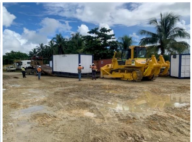
Figure 3: Arrival of earthmoving equipment on Woodlark