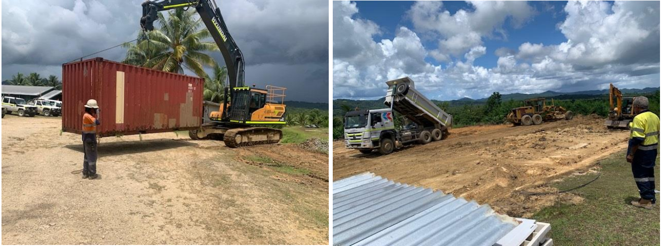
Figure 4: Progress of the foundations for the new core shed

Construction of a new core shed and supporting infrastructure commenced with arrival of the earthmoving gear on site. Numerous containers holding drill core and pulps that were removed, and sorted, allowing for the start of the pad construction (Figure 4).