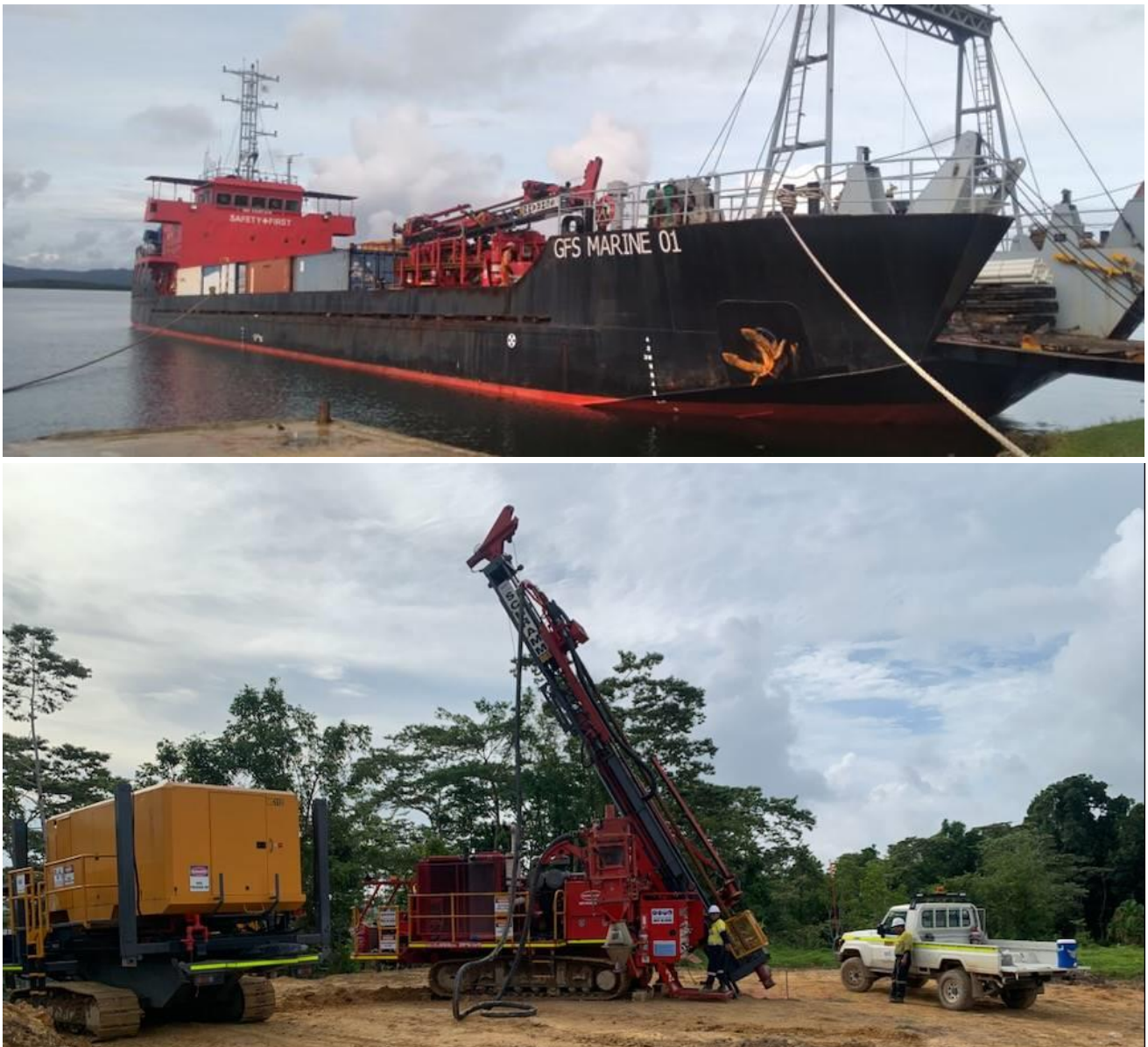
Figure 2: Barge carry drilling equipment and supplies unloading at Woodlark (top), and RC rig setup