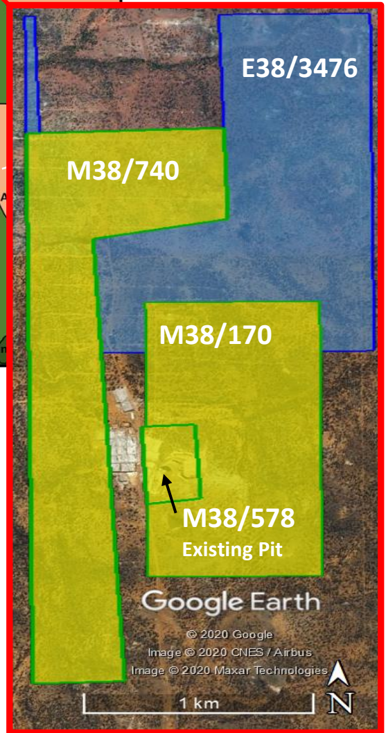
Figure 1: Location of Cox's Find Gold Project in relation to operating mills and additional exploration licence application (E38/3476)