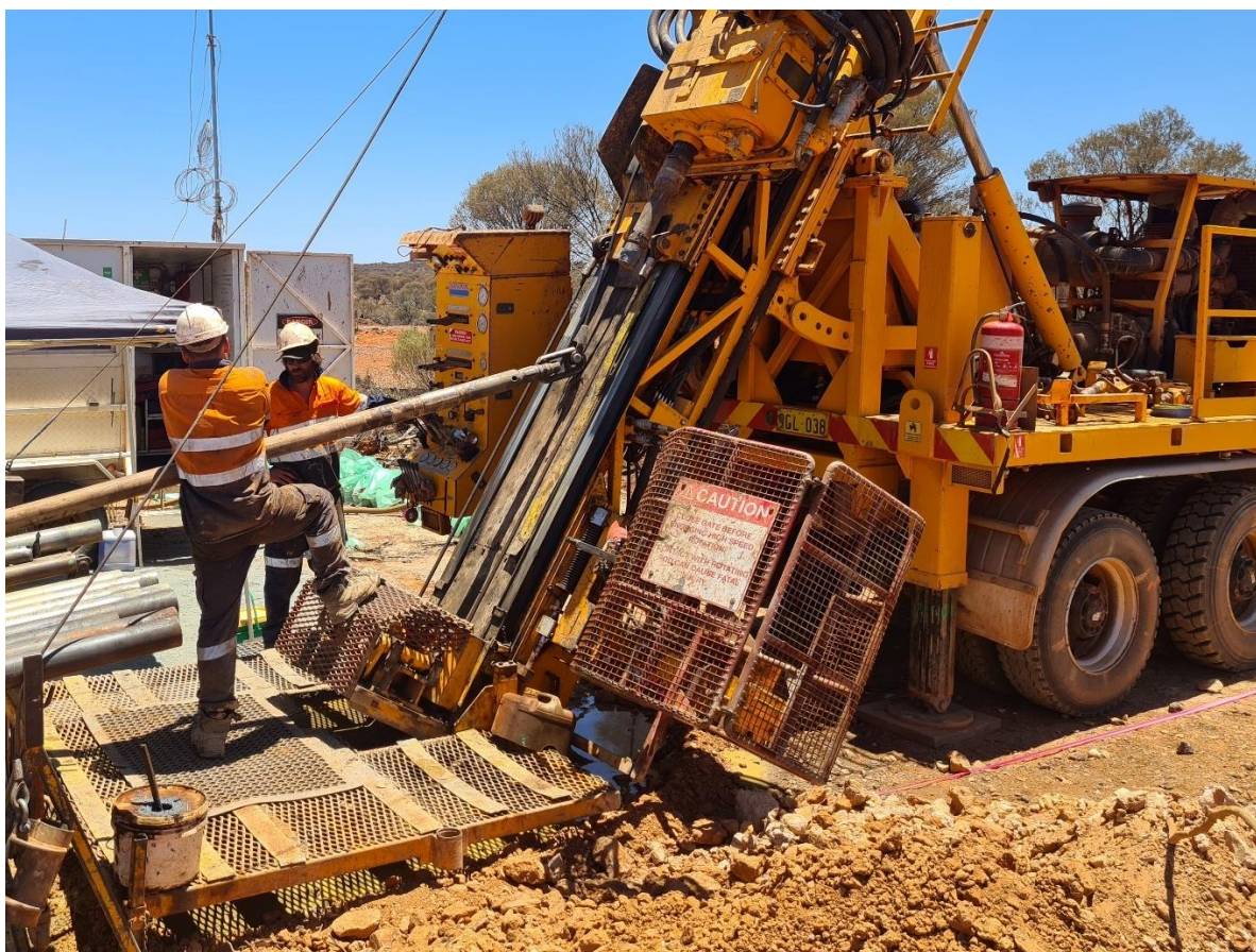
Photo – Diamond Drilling at Southern Star, December 2021

Great Southern Mining Limited (ASX: GSN) (“ GSN ” or the “ Company ”) is pleased to announce that Diamond Drilling is underway at the Southern Star Gold Deposit at its 100% owned Duketon Gold Project located 45km north of Laverton, Western Australia (Figure 2).